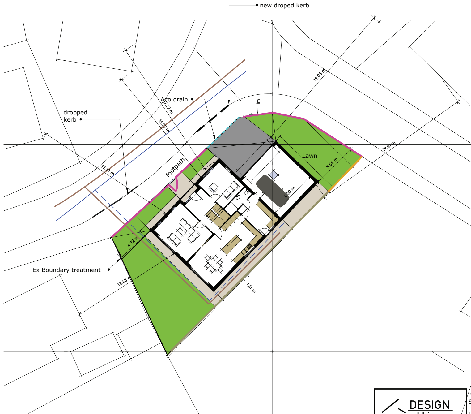
Site Plan 1:200