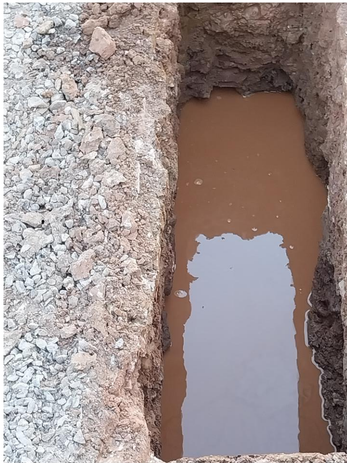
PHOTO 02 PIT WITH 0.8M DEPTH OF WATER