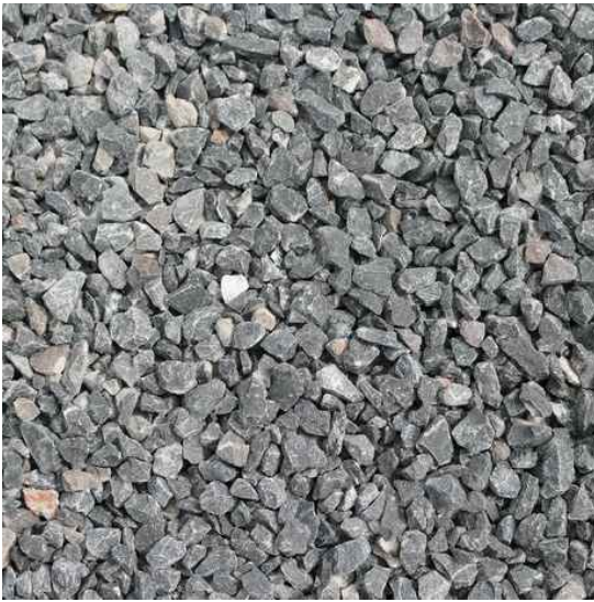
Example stone chipping's for footpath