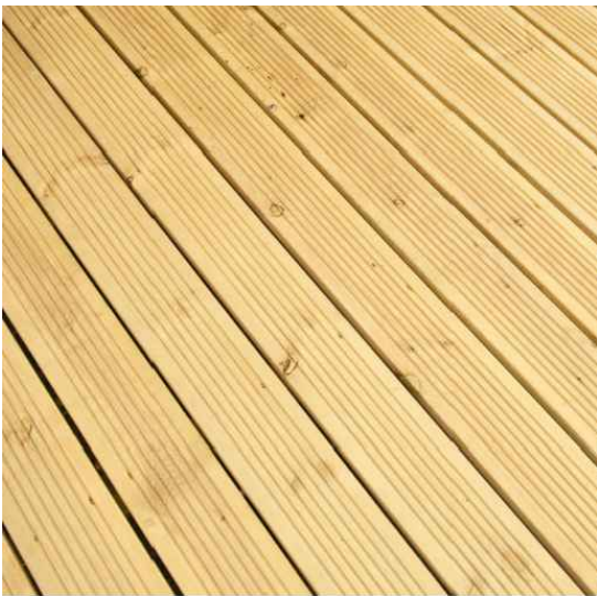
Example tanalised timbre decking.