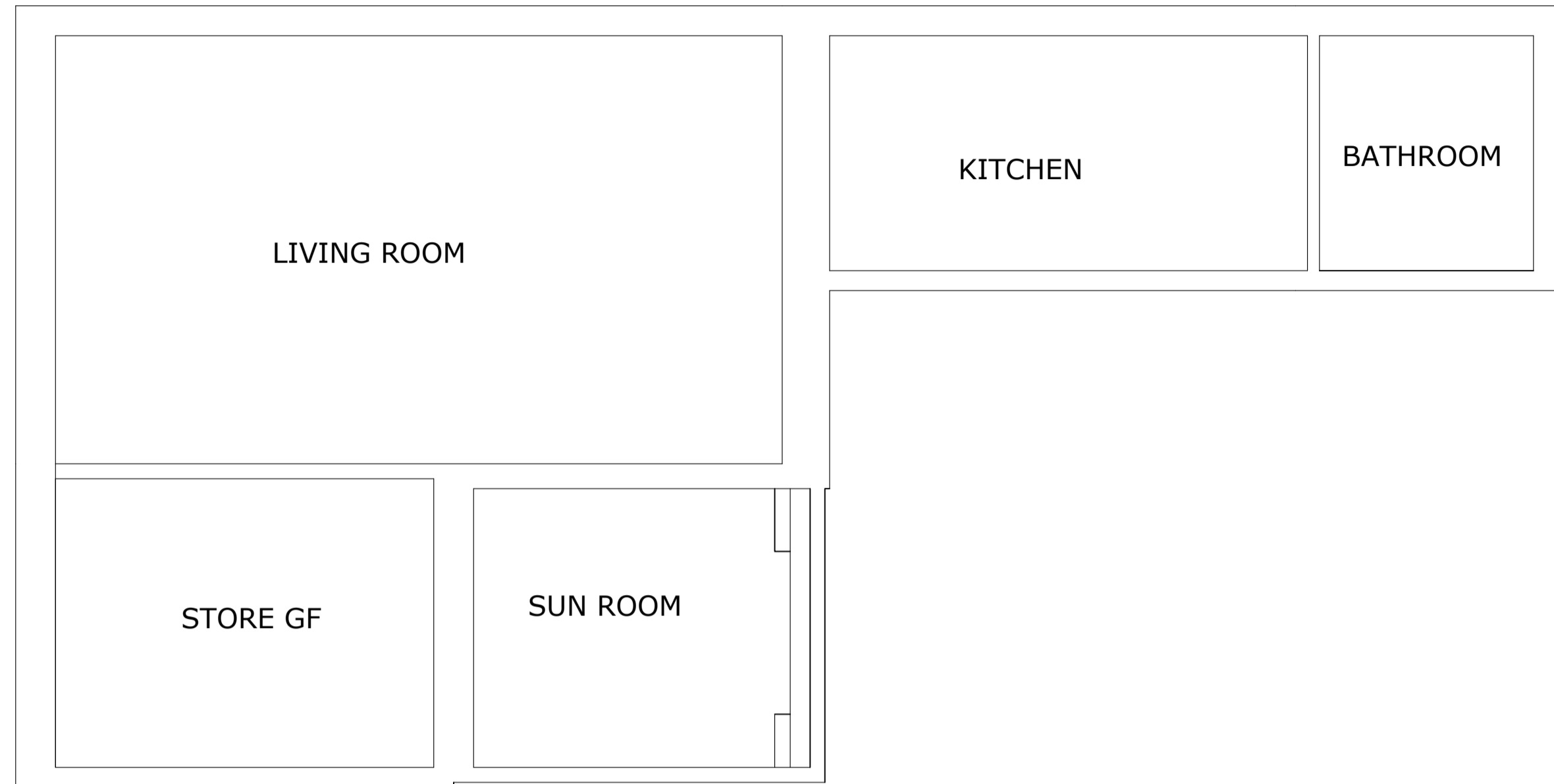
GROUND FLOOR PLAN EXISTING SCALE 1:50