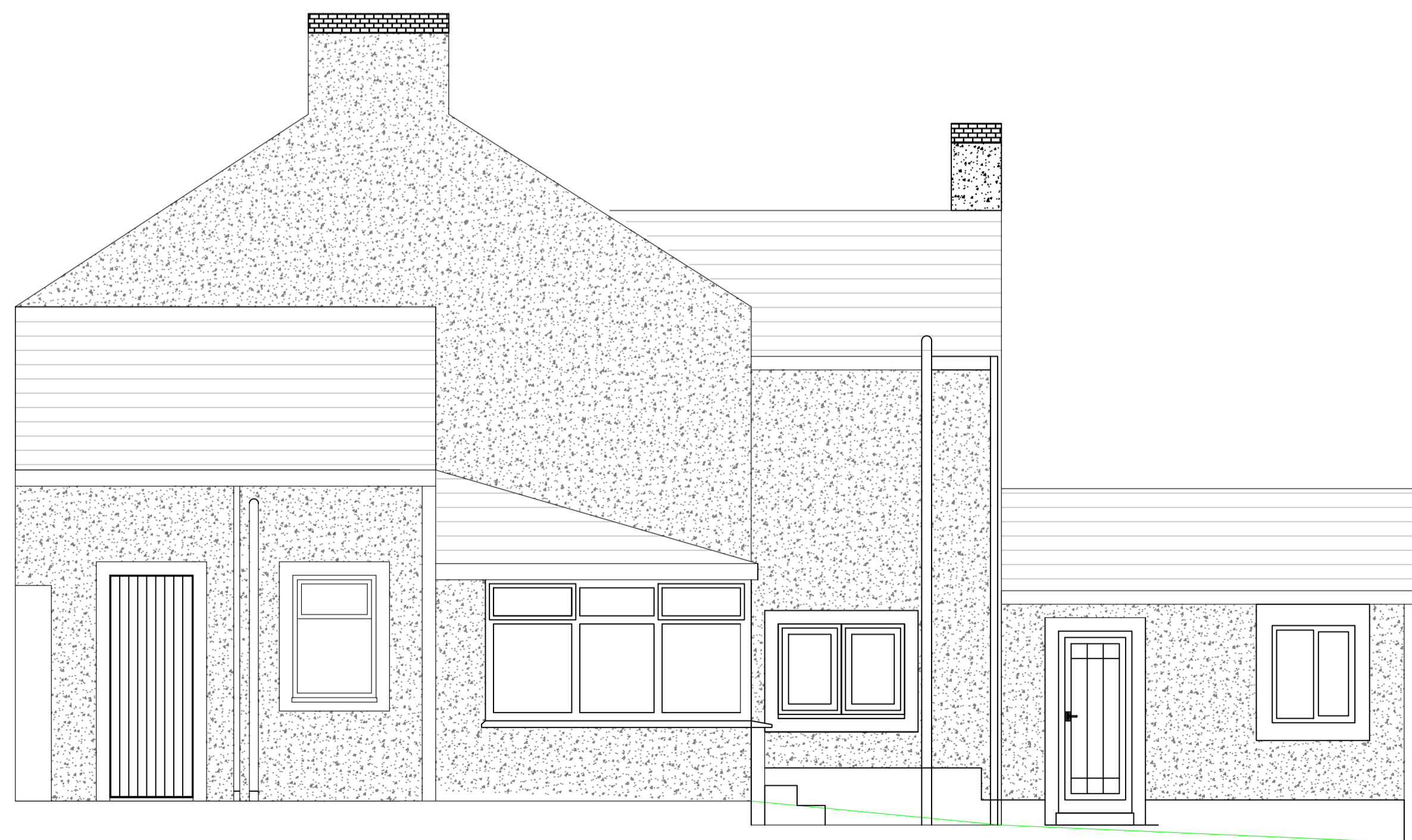
EXIST SOUTH ELEVATION