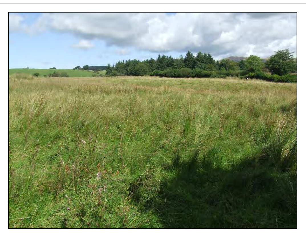
Photo 24: Site Interior – View across the site looking north east from the south western corner of the site