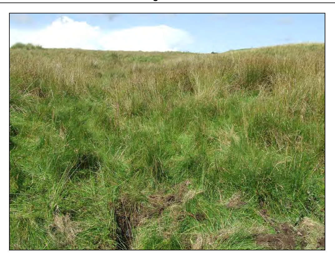
Photo 18: Site Interior – Small issue of water from the valley bottom and close to the southern site boundary, looking north