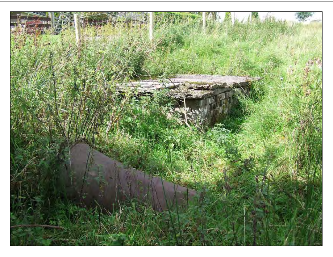
Photo 22: Site Interior – Old partially buried rusted metal drum located in the south western corner of the site near the brick tank shown on photo 21