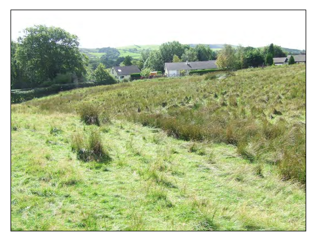
Photo 17: Site Interior – Lower section of small valley shown on photo 16, looking south west