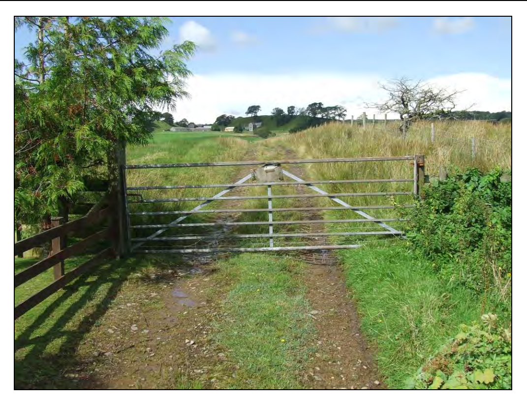
Photo 7: Perimeter – Gate adjoining the north western corner of the site (right) with track leading to Stockhow Hall