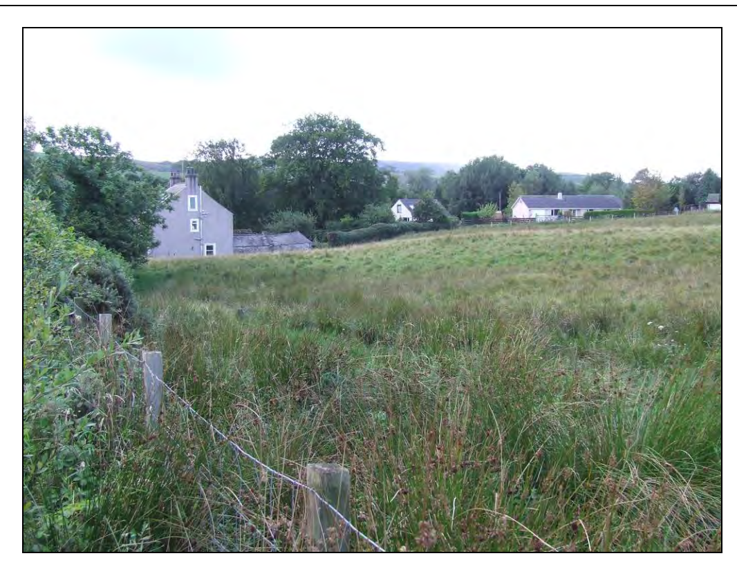
Photo 12: Site Interior – Low lying area of wet ground dominated by rushy grass on the eastern side of the site, as observed from eastern boundary fence