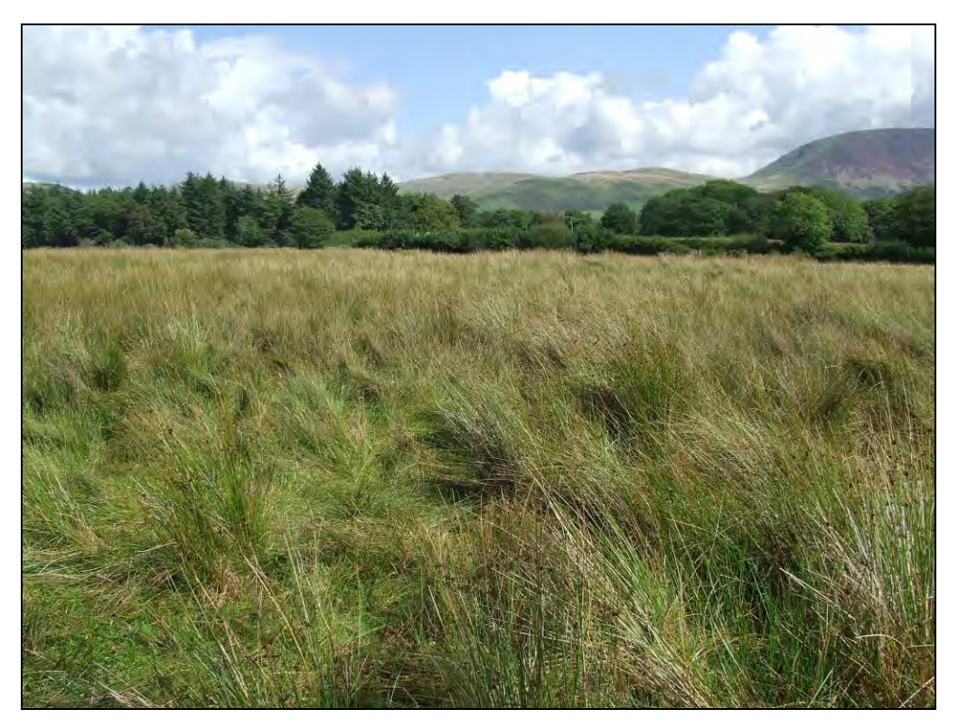
Photo 9: Perimeter – View across the northern site boundary (undefined on the ground), looking towards the north eastern corner of the site (identified by tree below tallest conifer)