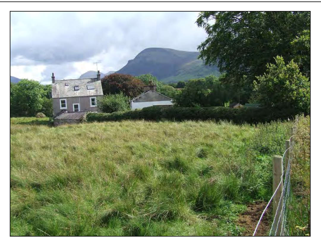
Photo 5: Perimeter – View of the western part of the southern site boundary (delineated by garden hedge), looking south from western site boundary