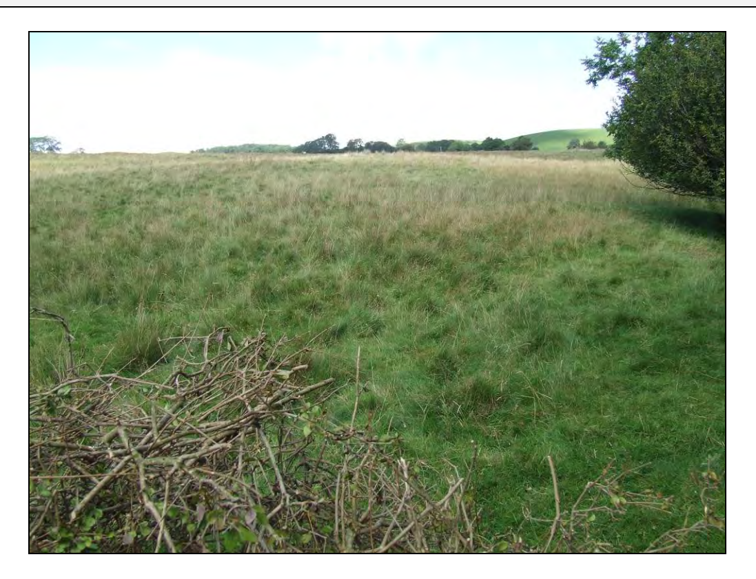
Photo 15: Site Interior – View across the site looking north from within the south eastern corner, showing hedge clippings from adjoining garden