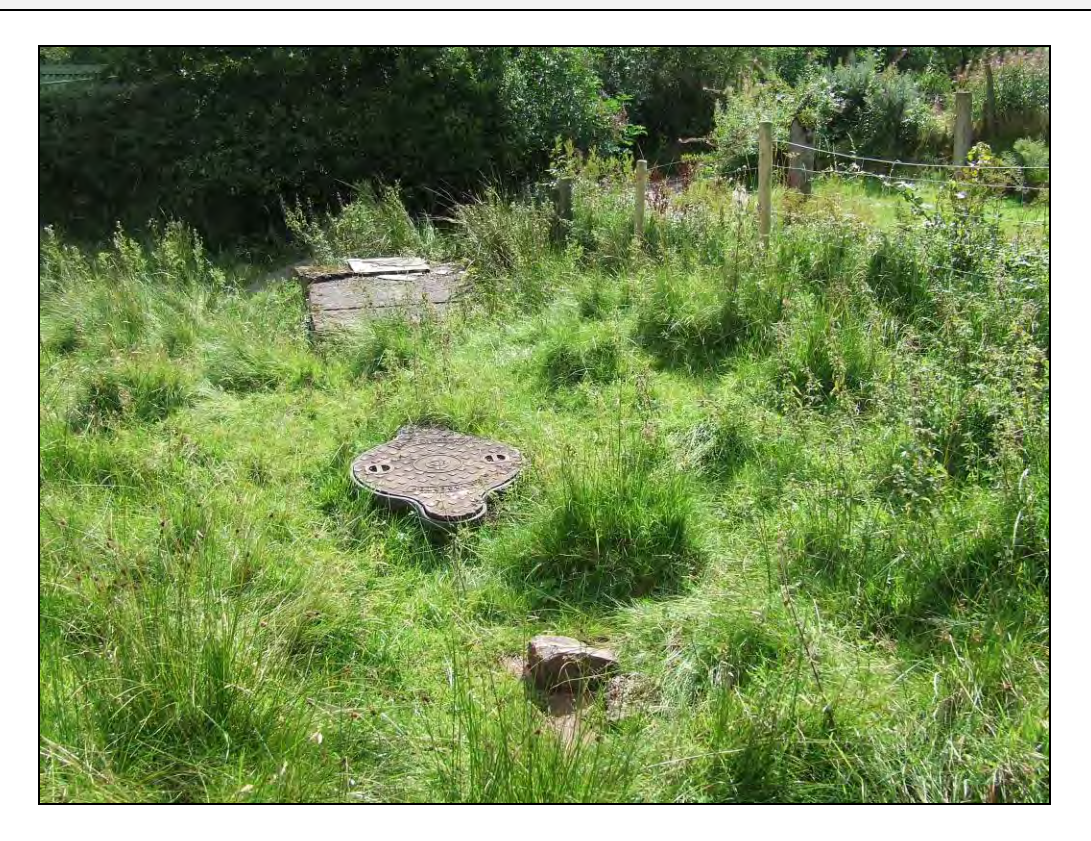
Photo 21: Site Interior – Small private sewage treatment plant located within south western corner of the site with square metal MH cover (foreground), large cast iron MH cover to Klargester (centre) and rectangular brick constructed sump or soakway (top)