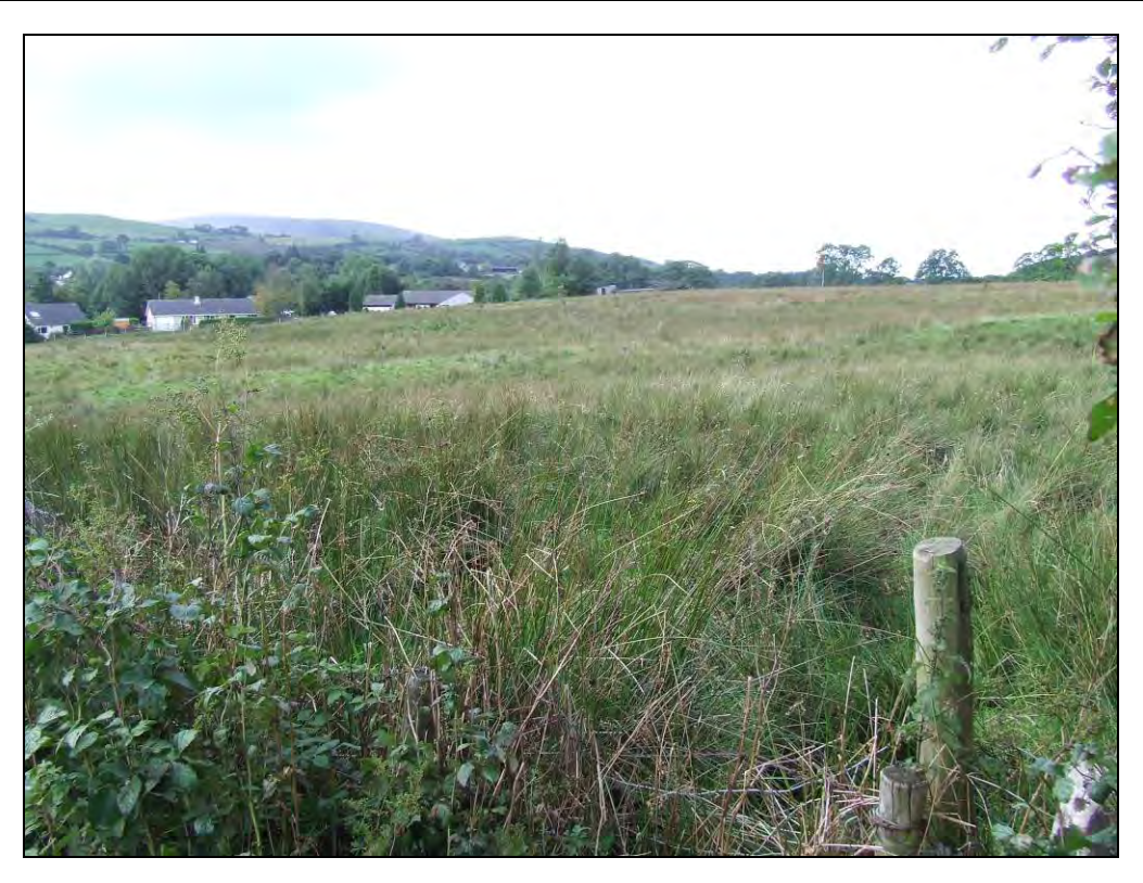
Photo 2: Perimeter – View across the northern site boundary (undefined on the ground), looking south west from a former gated entrance adjoining the layby