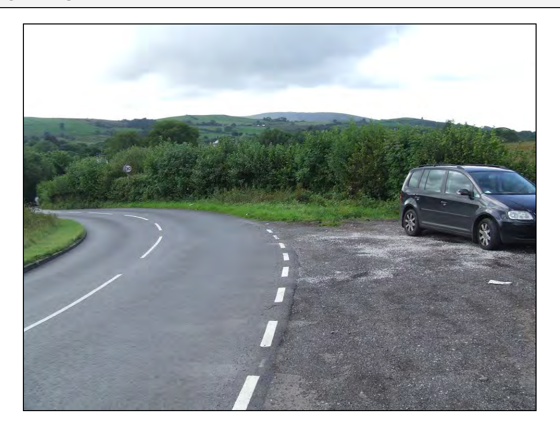
Photo 1: Perimeter – Layby off Kirkland Road adjoining the north eastern corner of the site, looking south west