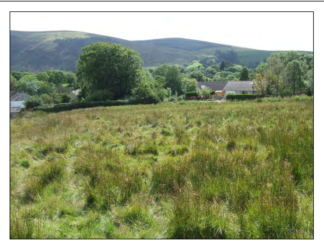
Photo 25: Site Interior – View across the site looking south from the northern site boundary