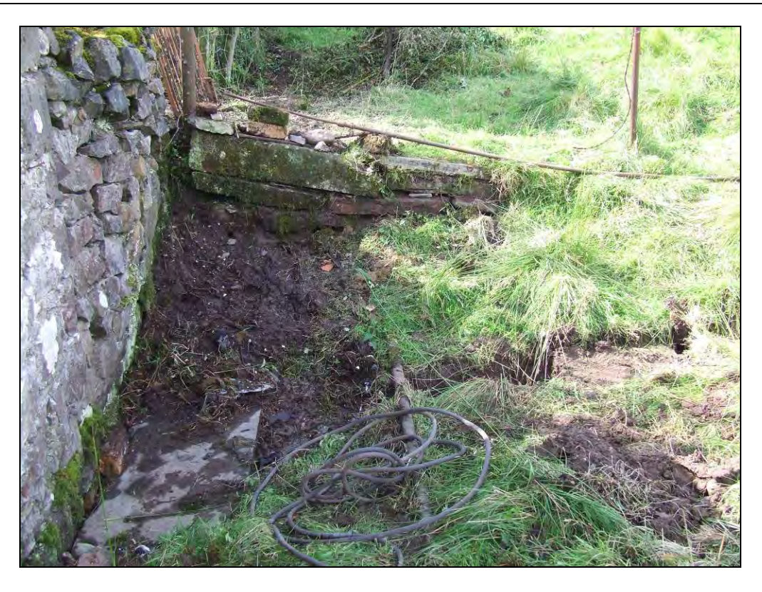
Photo 20: Site Interior – View of small stream channel shown on photo 19, looking west and showing metal pipe crossing path of channel