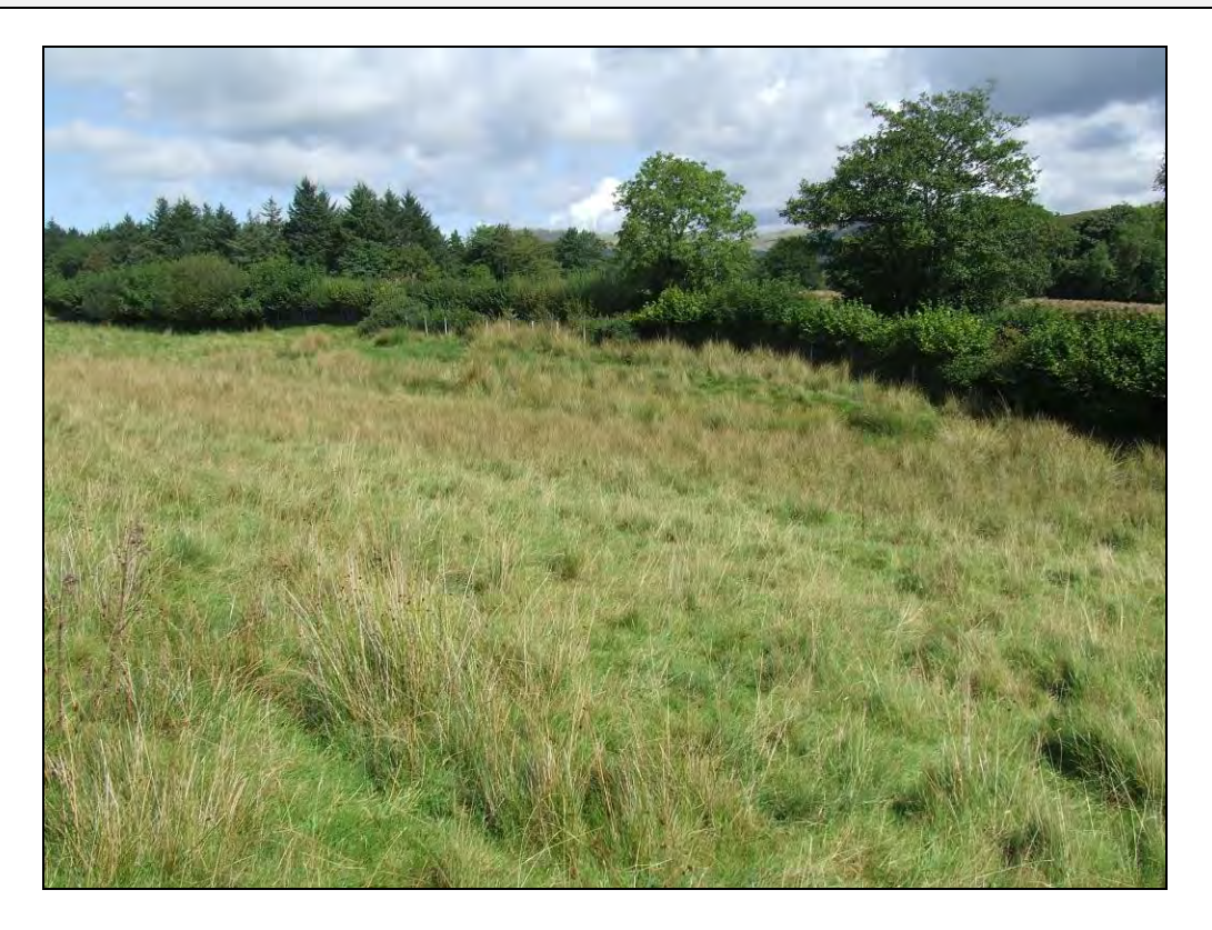
Photo 13: Site Interior – Low lying area of wet ground in the eastern part of the site, looking north east towards the eastern site boundary