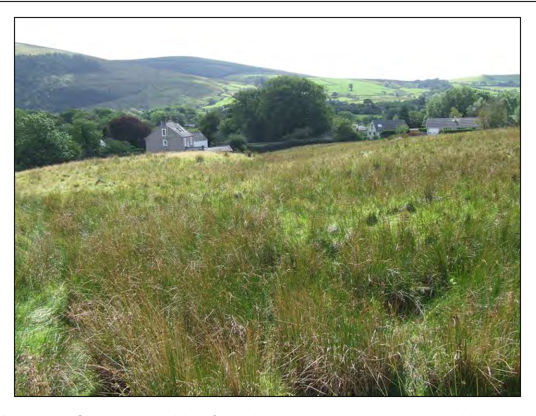
Photo 16: Site Interior – View from the northern site boundary looking south down a small valley defined by the presence of rushy grass