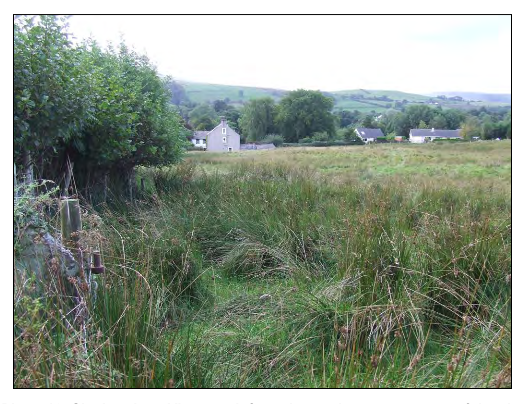
Photo 10: Site Interior – View south from the north eastern corner of the site