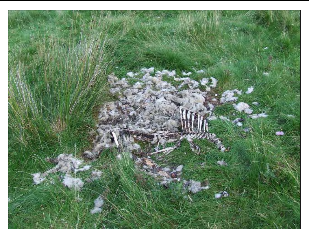
Photo 11: Site Interior – Remains of sheep carcass within the eastern part of the site