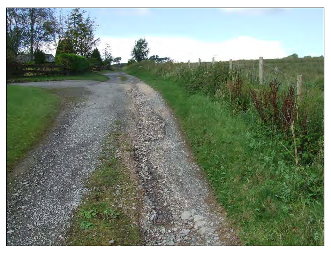
Photo 6: Perimeter – View along western site boundary delineated by post and wire fence adjoining gravel track, looking north from the south western corner on the site