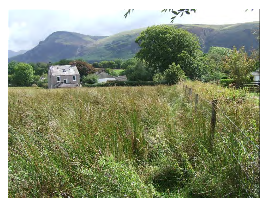
Photo 8: Perimeter – View south along the inside of the western site boundary from the north western corner of the site