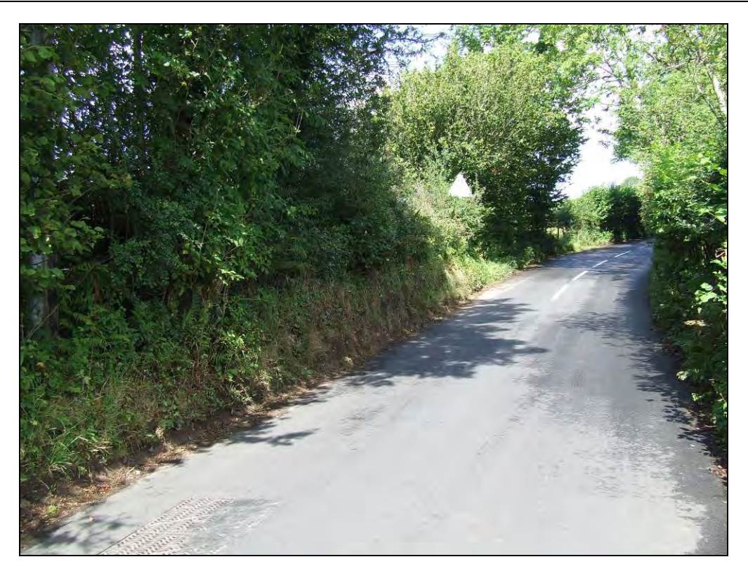
Photo 3: Perimeter – View along the eastern site boundary with Kirkland Road from the south eastern corner of the site, looking north towards the location of the culvert