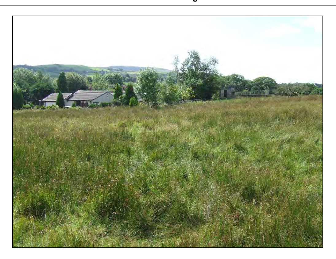
Photo 26: Site Interior – View across the site looking south west along part of the northern site boundary towards the north western corner (identified by trees in centre)