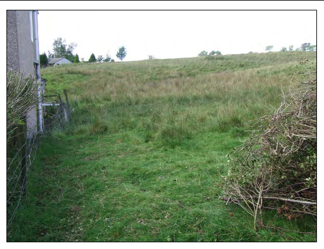
Photo 4: Perimeter – View along eastern part of the southern site boundary with adjoining residential dwelling, looking west from the south eastern corner of the site and showing garden hedge clippings (right)