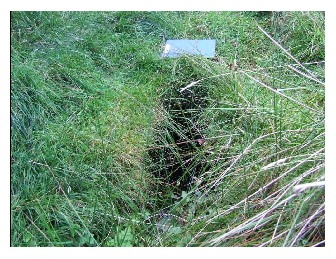
Photo 14: Site Interior – Small issue of water from the low lying area of land and near the eastern site boundary. The stream is believed to flow into the culvert extending beneath Kirkland Road