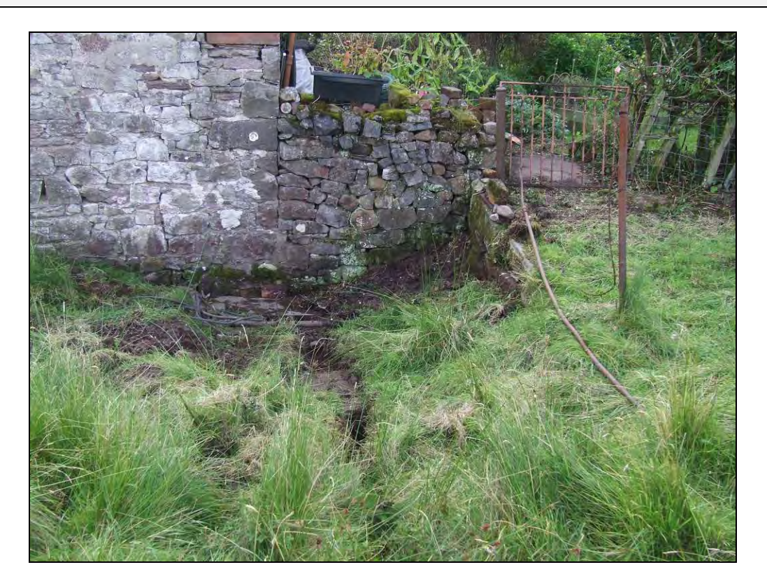
Photo 19: Site Interior – Small issue of water shown on photo 18, showing path of stream flowing south towards edge of outbuilding on southern site boundary, but disappearing beneath stone slab (centre)