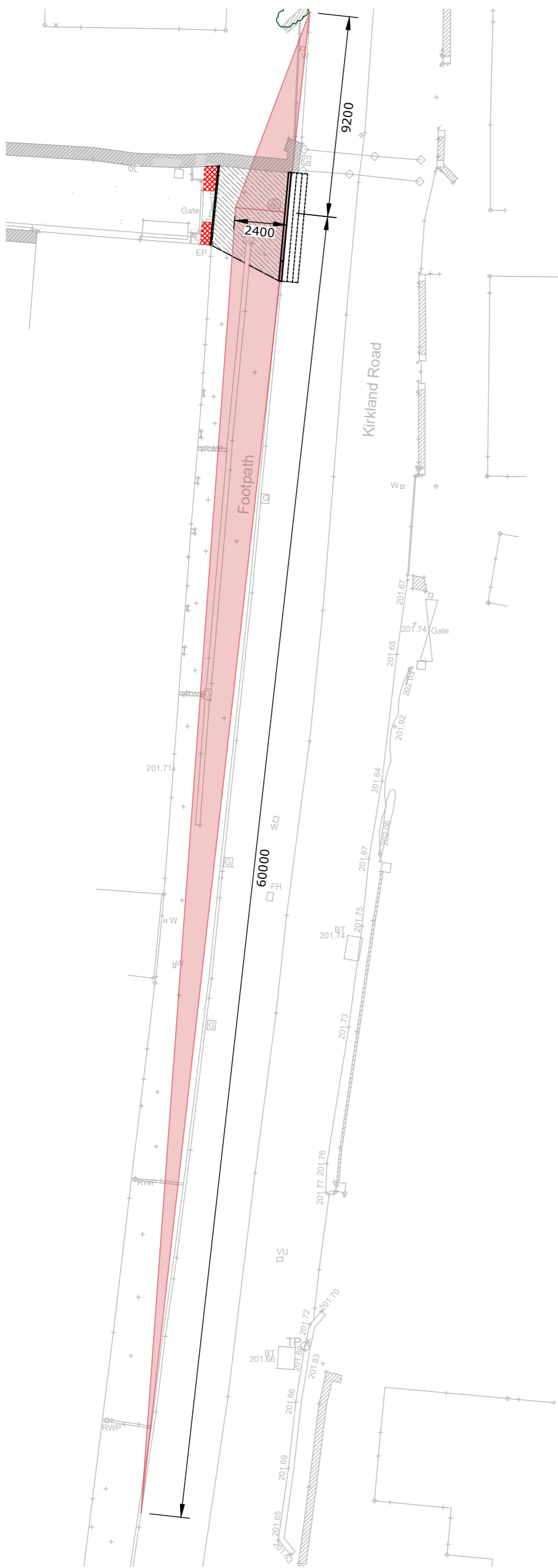
Plan on Visibility Splays Scale 1:200