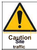
Warning Site Traffic

strategically placed throughout the site to ensure all individuals are aware of surroundings and potential hazards.