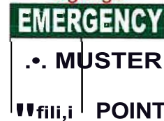
Emergency Assembly Point