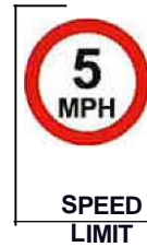
Site Speed Limit