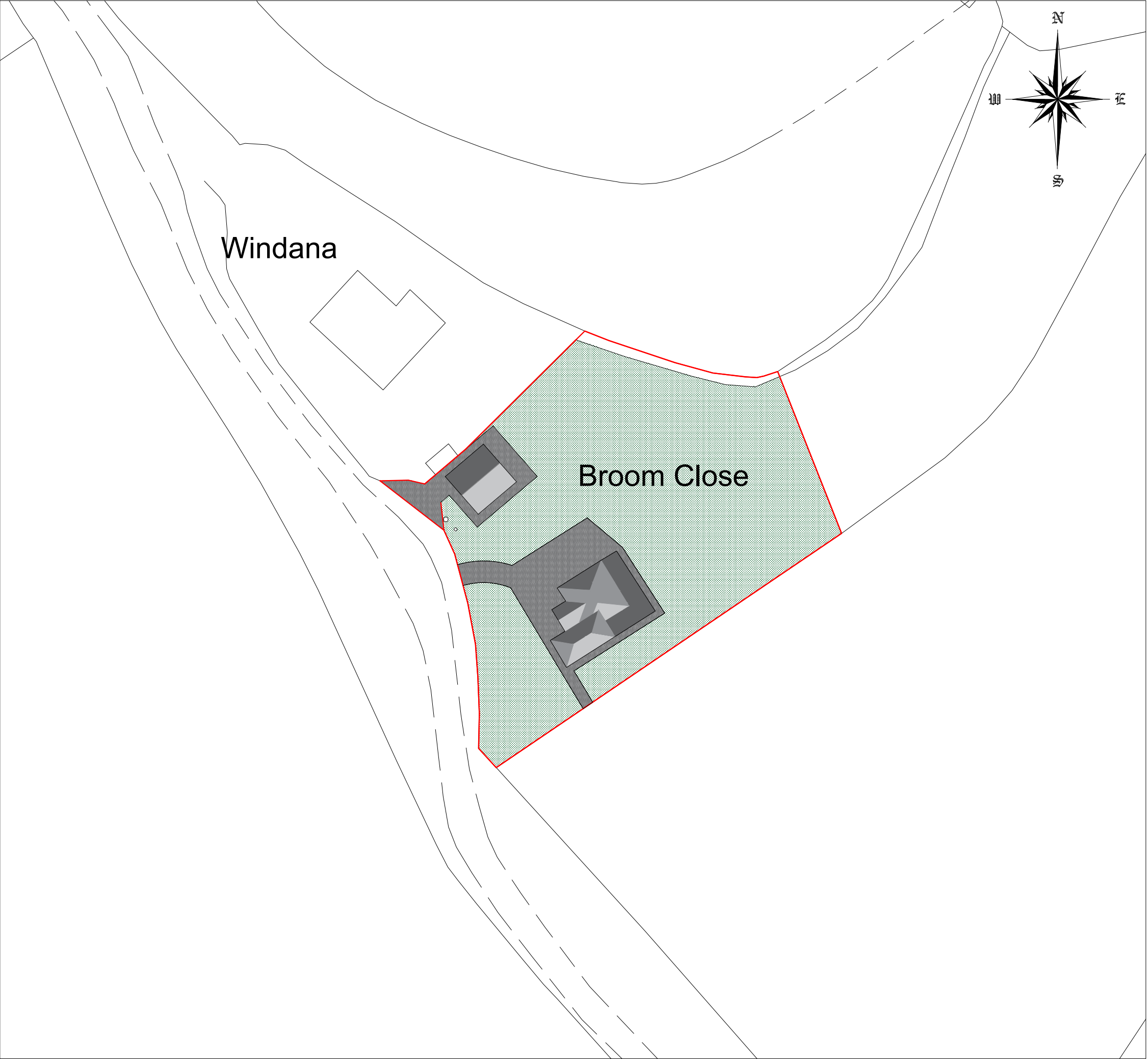
Block Plan 1/500