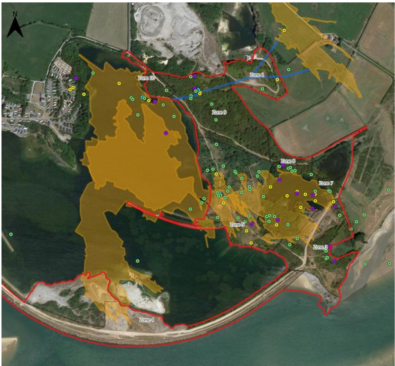
Figure 2 – Mining Features

In order to understand the presence of mine entries on site, prior to Intrusive Ground Investigation, Curtins conducted a site walkover along with a visit to the Cumbria Archives to collect the Premise Record Plans from 1866 – 1969, and items from the Millom Discovery Centre from 1862 – 1974; along with conducting a desk-based search.