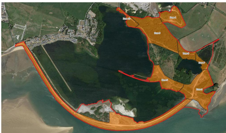
Figure 1 – Site Location Plan with Development Zones, site boundary is shown in red.

The main development is proposed in Development Zone 1, where a Visitors Centre building will be constructed. The remainder of the Development Zones will receive some development such as new roads, paths and hides. The locations of the Development Zones are illustrated in Figure 1.