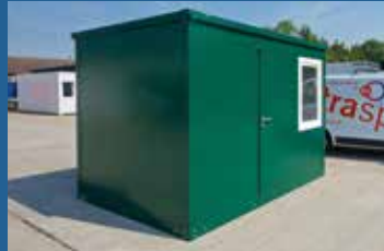
Expandakabin - Flat-packed office unit home and commercial use