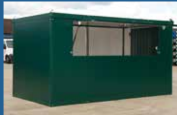
Expandakiosk - Flat-packed storage unit with serving hatch