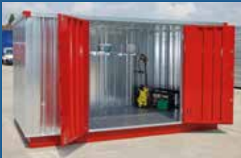
Expandachem - Flat-packed storage unit for the safe storage of chemicals and lubricants