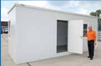
Expandacom - Flat-packed office/ accommodation unit