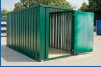
Expandastore - Flat-packed storage unit