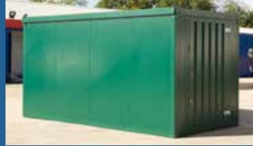
ready for use