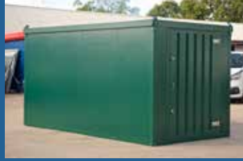
Insulated Store - Flat-packed storage unit