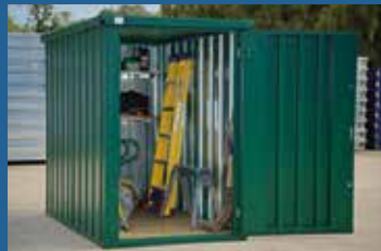
Gardenstore - Flat-packed secure storage unit for all your garden equipment