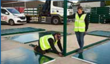
simple to assemble