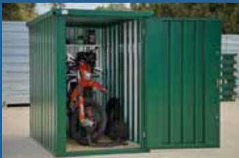
Bikestore - Flat-packed secure storage unit for cycles, motorcycles and tools