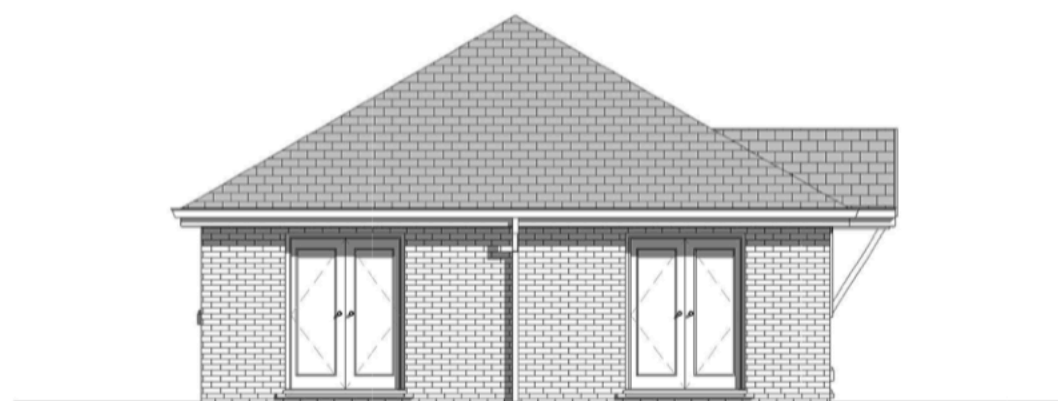
3 NORTH ELEVATION 1 : 100