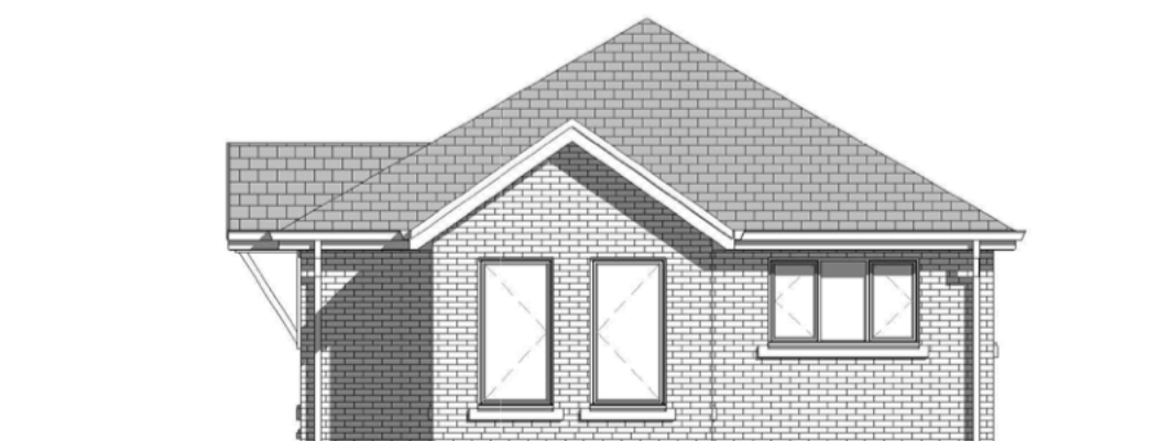
4 SOUTH ELEVATION 1 : 100