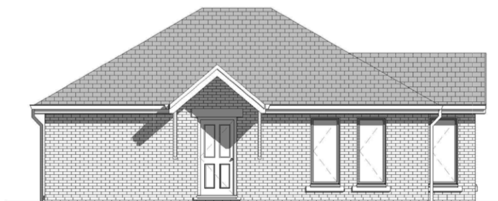
5 WEST ELEVATION 1 : 100