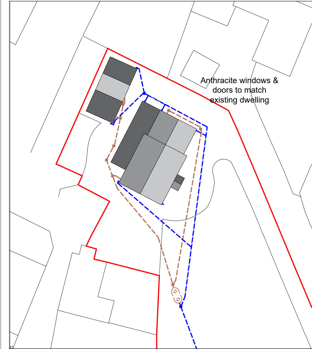
Site Plan 1-1250