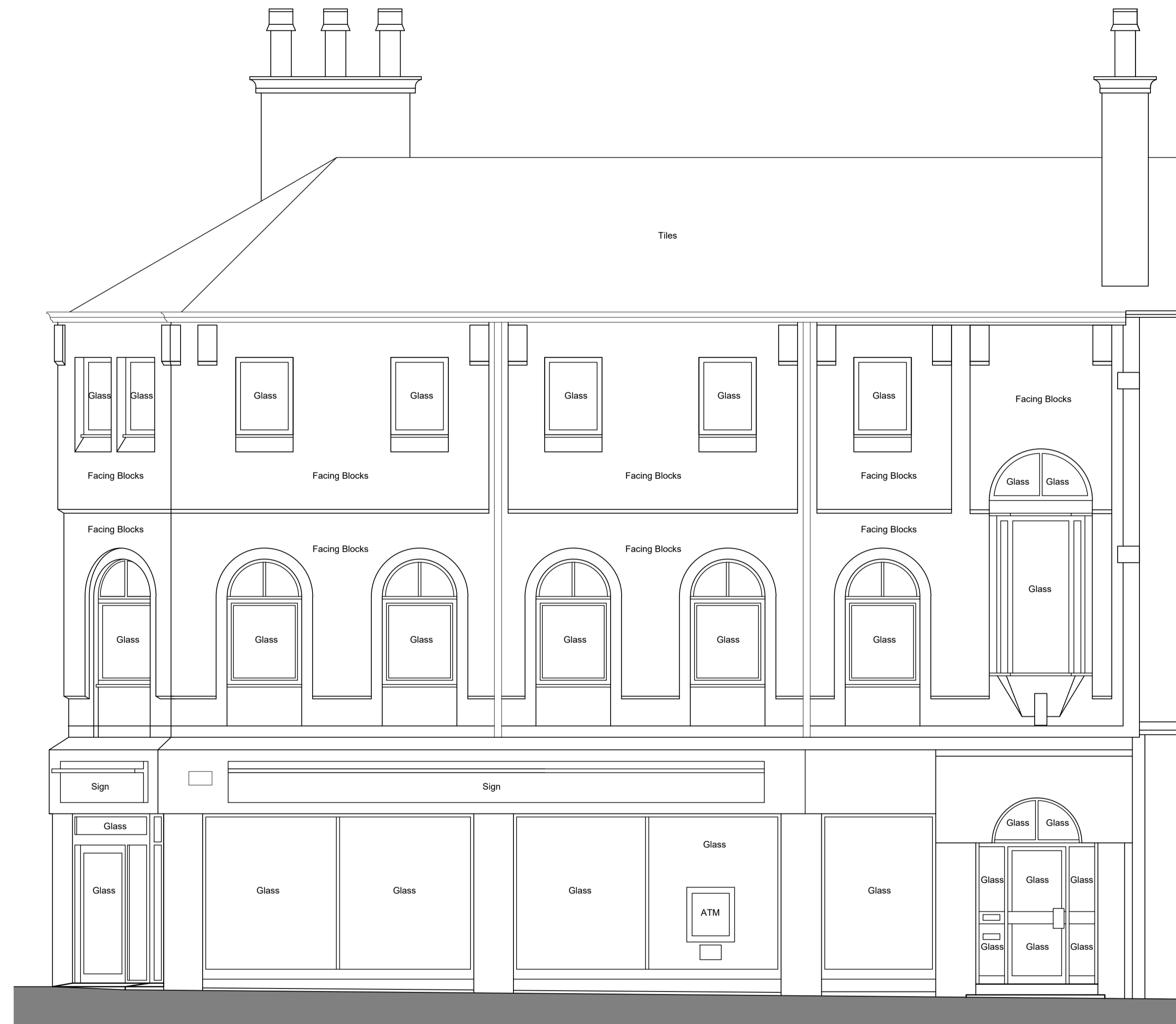
Elevation to King Street