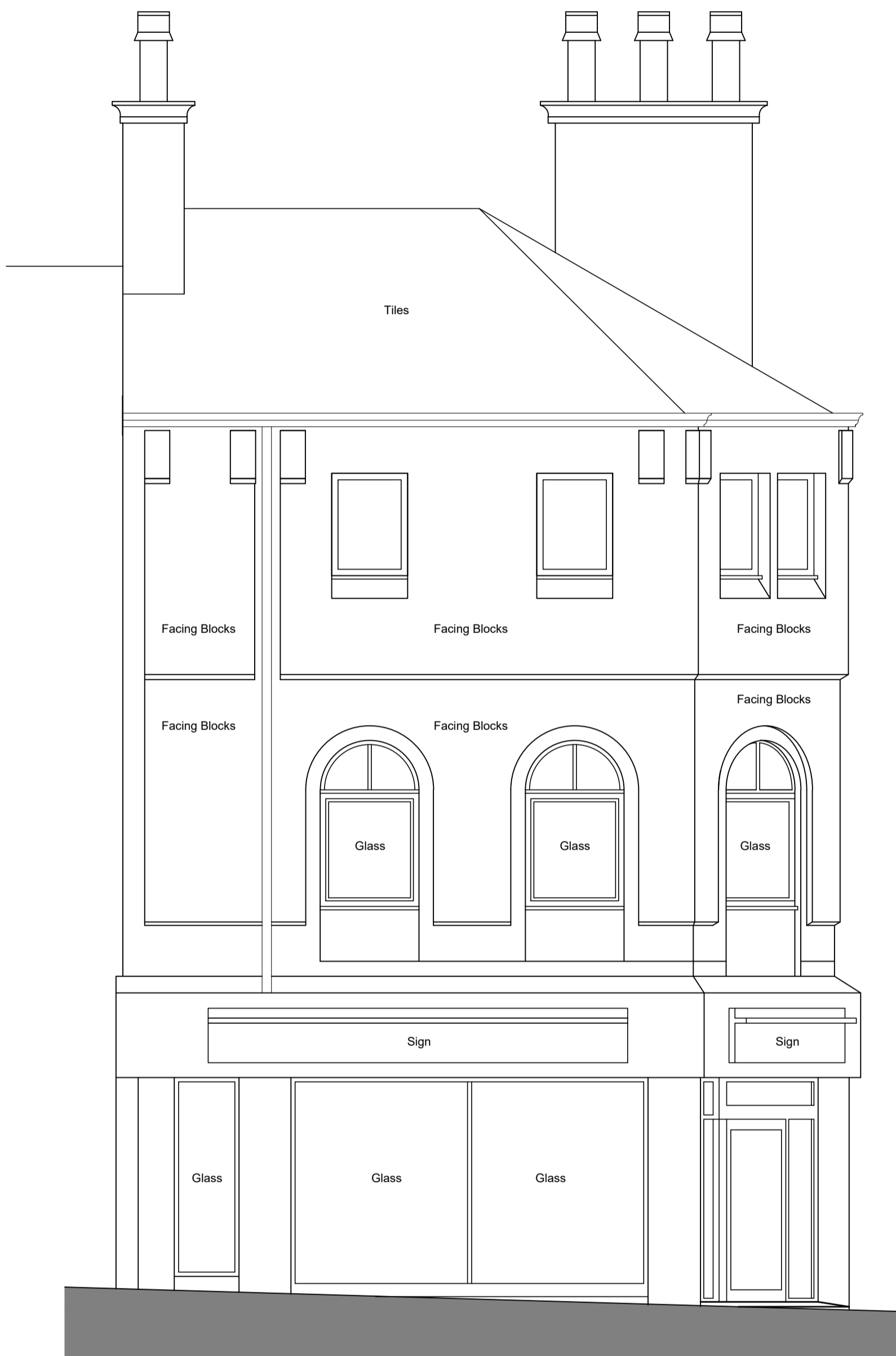
Elevation to Lowther Street