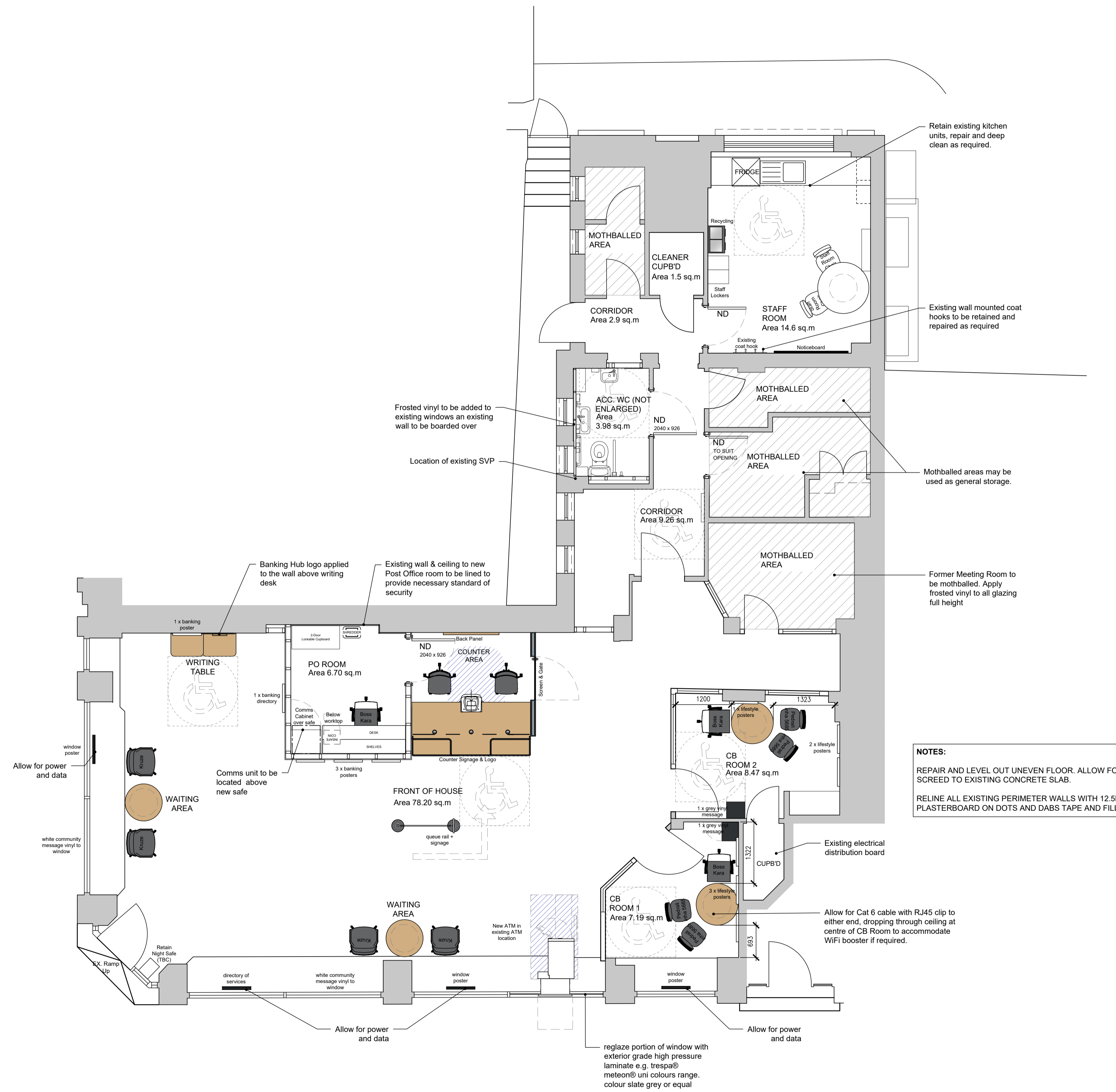
01 Ground Floor Plan - scale 1:50 @ A1