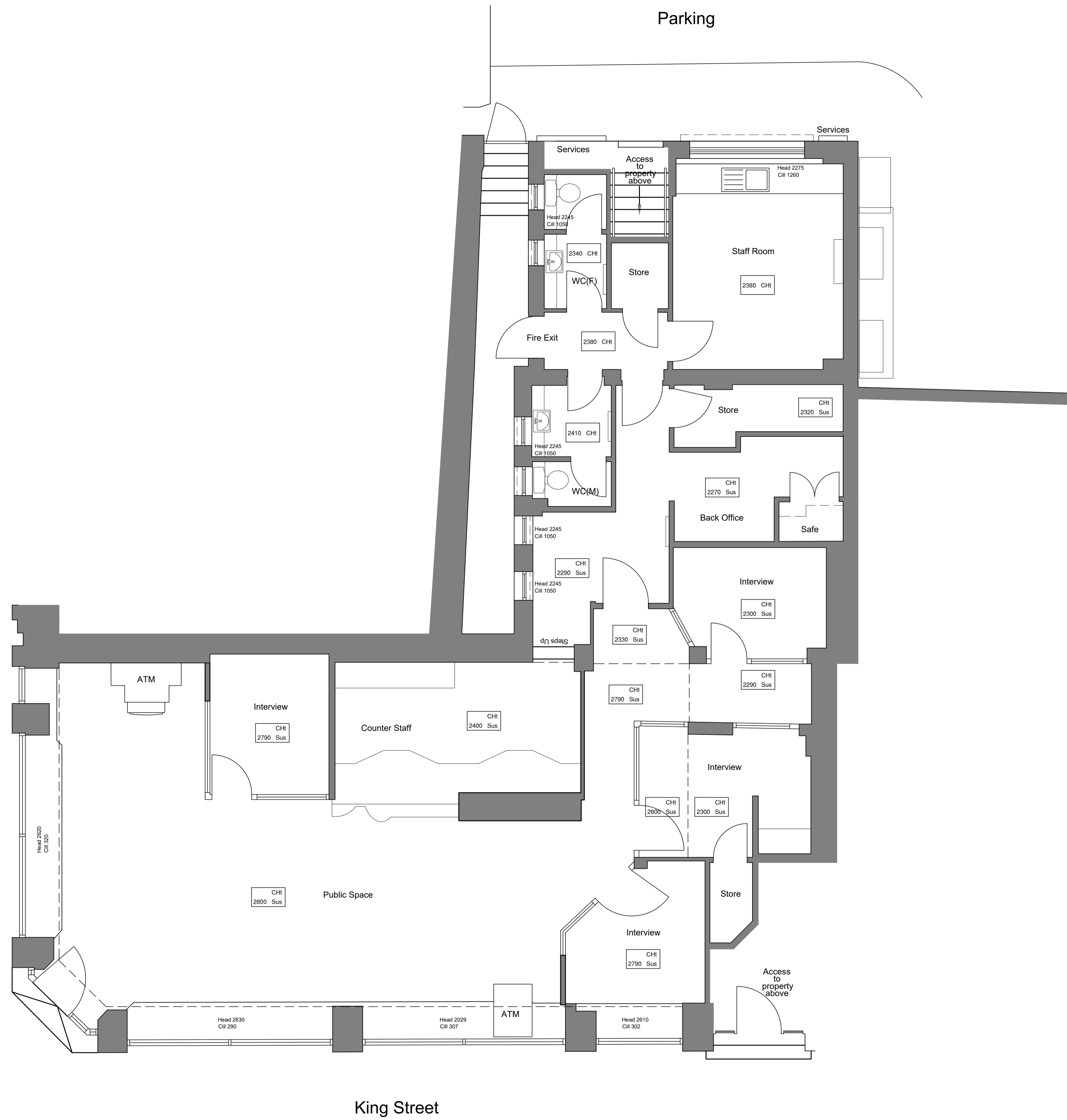
01 Ground Floor Plan - scale 1:50 @ A1