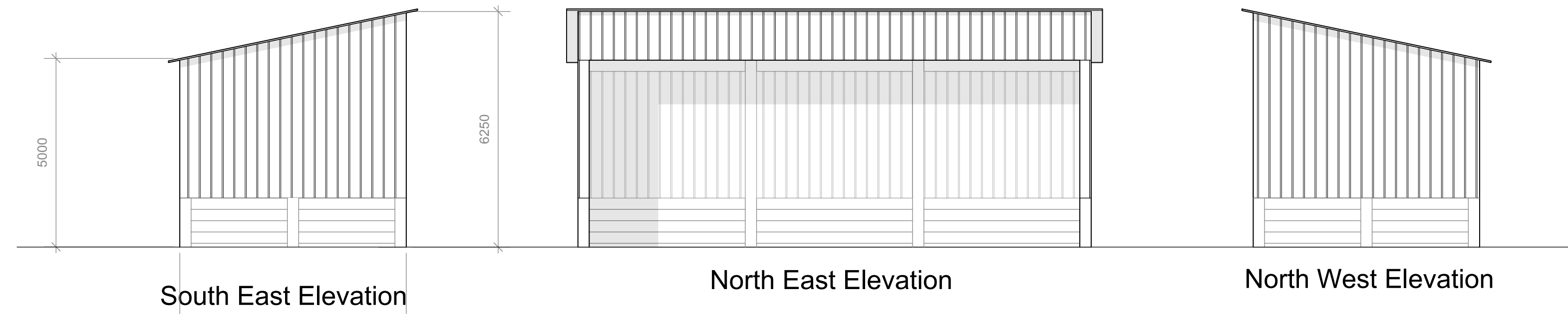
South East Elevation