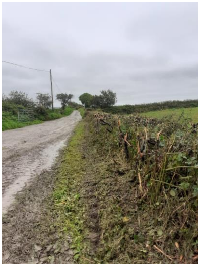
View up the lane towards the main road verge

The existing hedge is 1.20 in height as indicated on the images below and retained at that height.