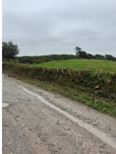
View of the hedge and the wide highway verge

The hedge is set back from the edge of the lane by approximately 1m at its smallest point leading up to at least 2m verge thus improving visibility.