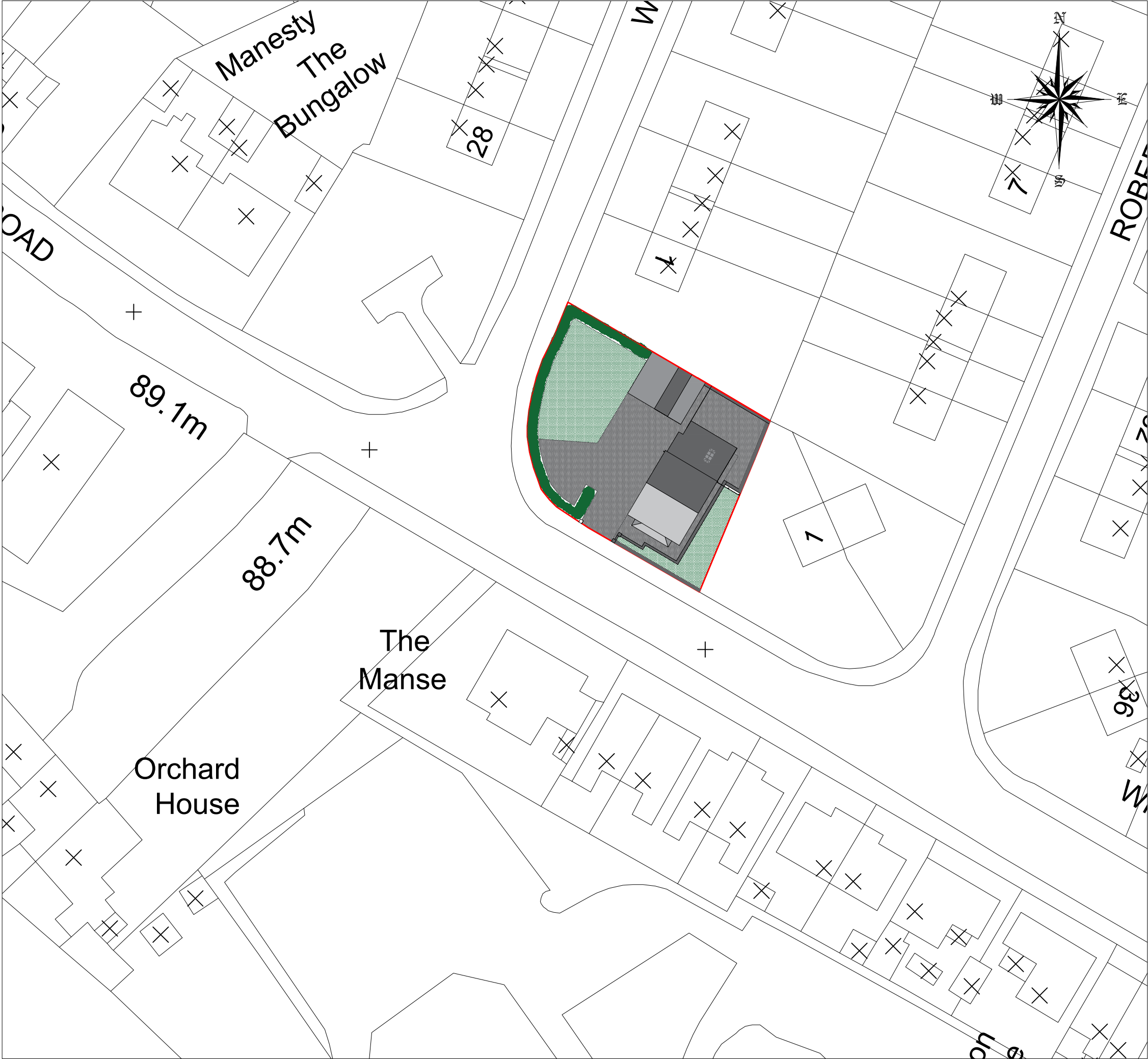
Block Plan 1/500