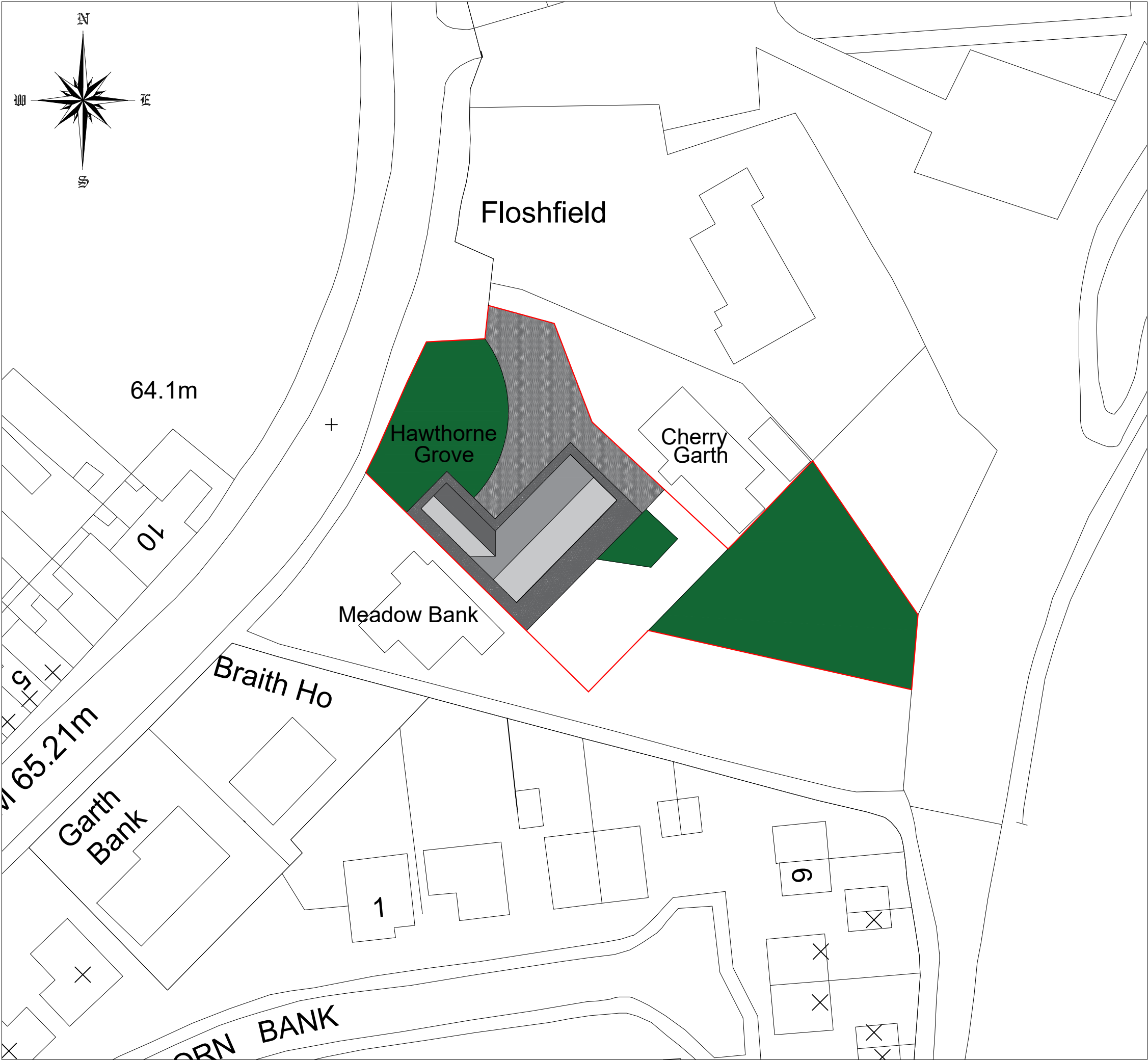
Block Plan 1/500