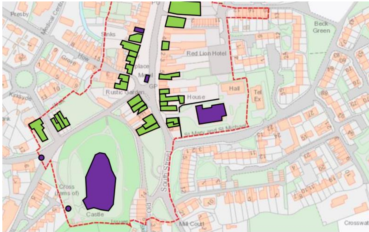
Figure 69 Egremont conservation area, showing listed buildings (purple) and positive townscape elements (green)