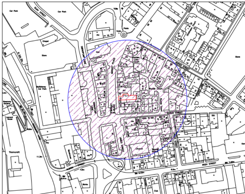
Map above shows 75m Radius from asset