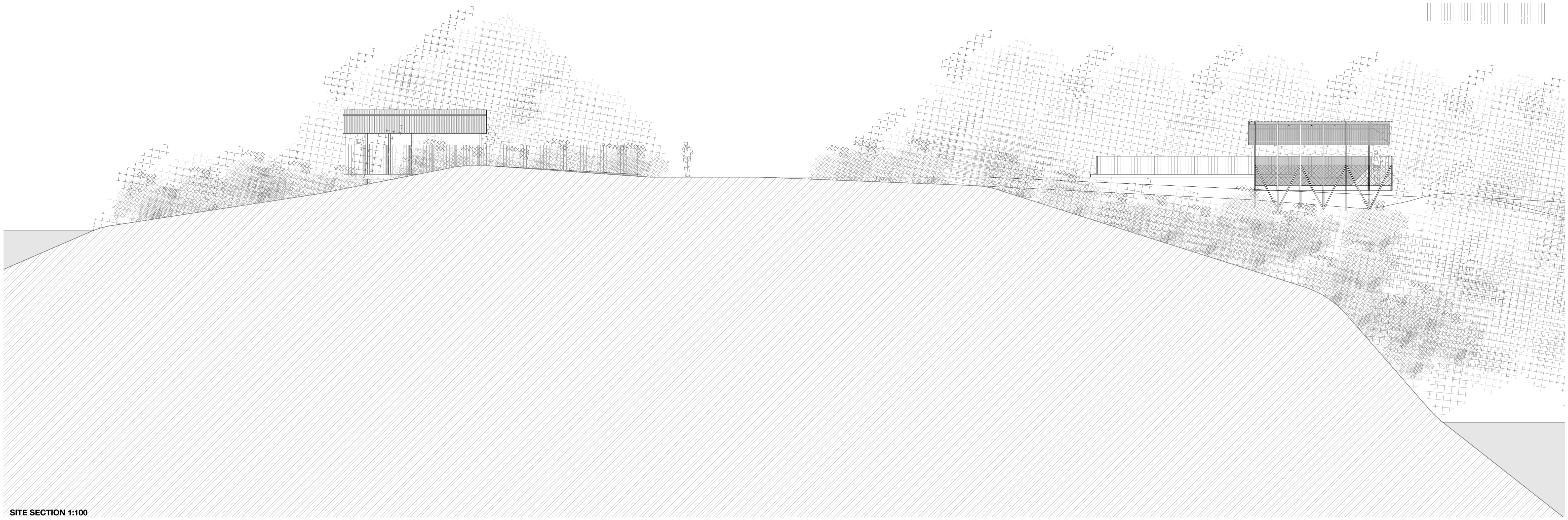
SITE SECTION 1:100