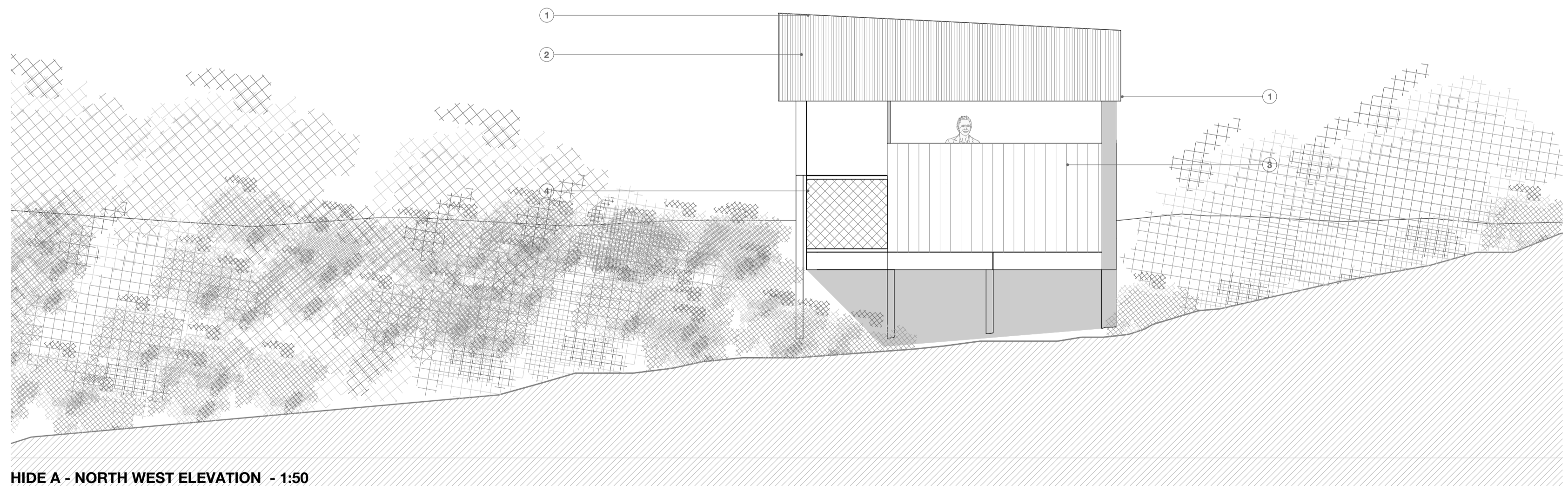
HIDE A - NORTH WEST ELEVATION - 1:50

GENERAL NOTES FOR CONTRACTORS The contractor is responsible for checking all dimensions, tolerances and references. Any discrepancy is to be notified to the Architects before proceeding with the work. Where an item is covered by drawings to different scales, the larger scale drawing is to take precedence. Do not scale drawings, figured dimensions are to be worked to in all cases. This drawing is copyright ©2023 GAGARIN Studio REVISION NOTES A - REVISED FOLLOWING ECOLOGISTS COMMENTS.