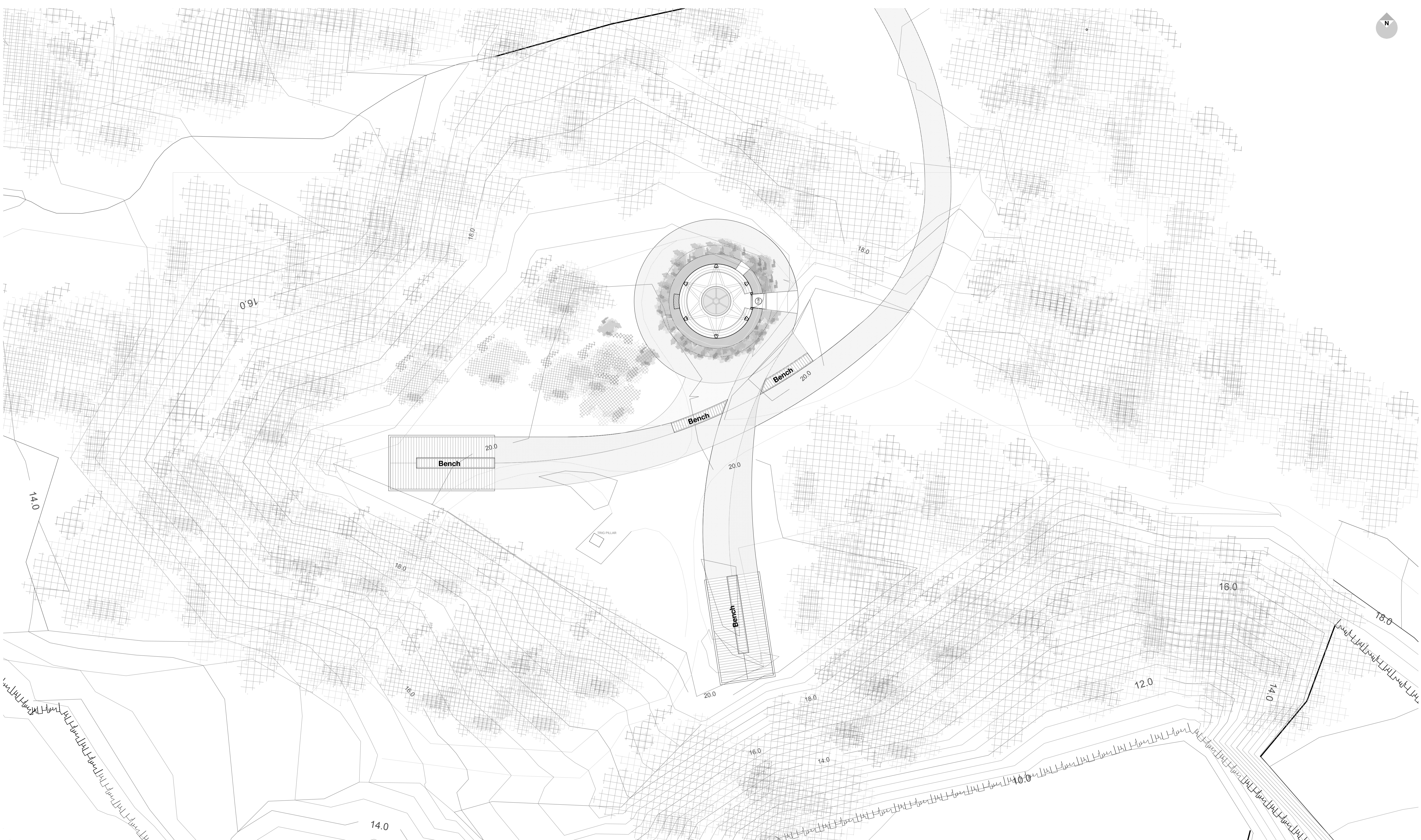
SITE PLAN - 1:100

GENERAL NOTES FOR CONTRACTORS The contractor is responsible for checking all dimensions, tolerances and references. Any discrepancy is to be notified to the Architects before proceeding with the work. Where an item is covered by drawings at different scales, the larger scale drawing is to take precedence. Do not scale drawings, figured dimensions are to be worked to in all cases. This drawing is copyright ©2023 GAGARIN Studio