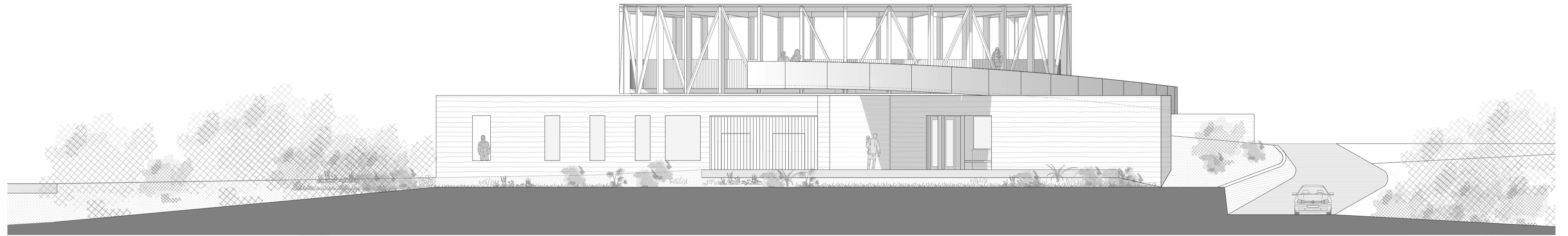
SECTION CC (1:100)