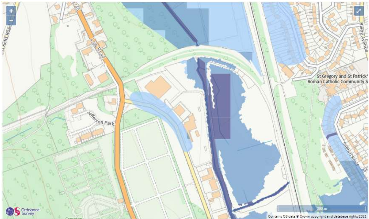
Extent of flooding from rivers or the sea