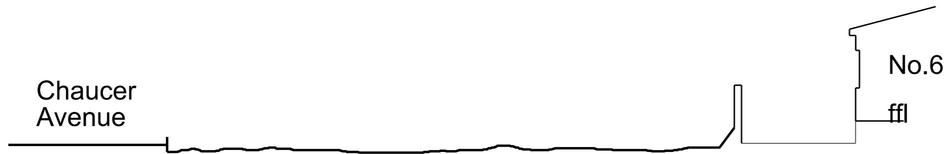
existing site section