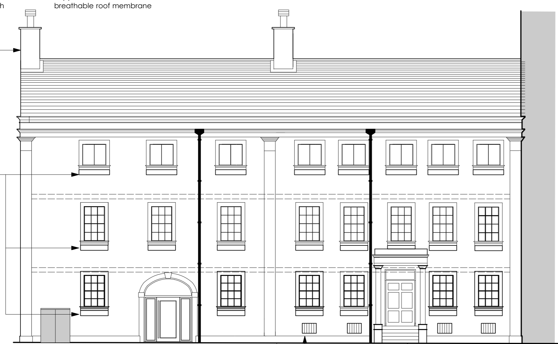
Front Elevation to Harbour new timber double glazed door screen - existing railing to side of ramp removed - Colour - Grey

window boxes added to front elevation ( may not require LBC )