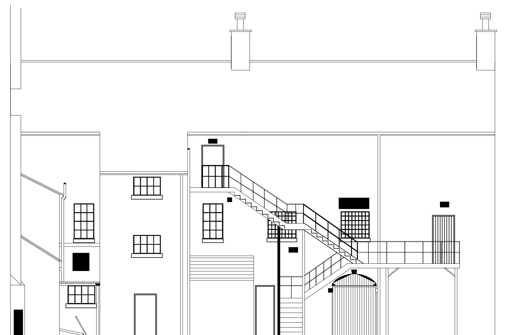
Rear Elevation to car park

Rev : F 22/05/22 - rooflights moved to rear roof pitch