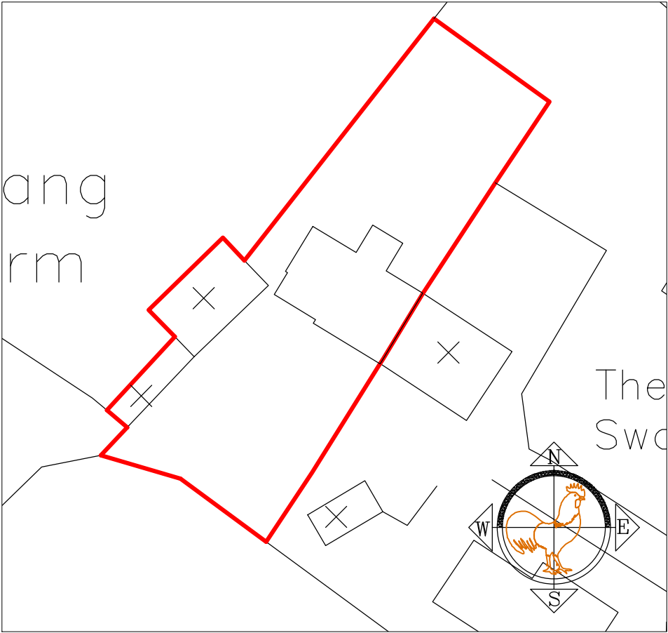
Location Plan Scale 1/500