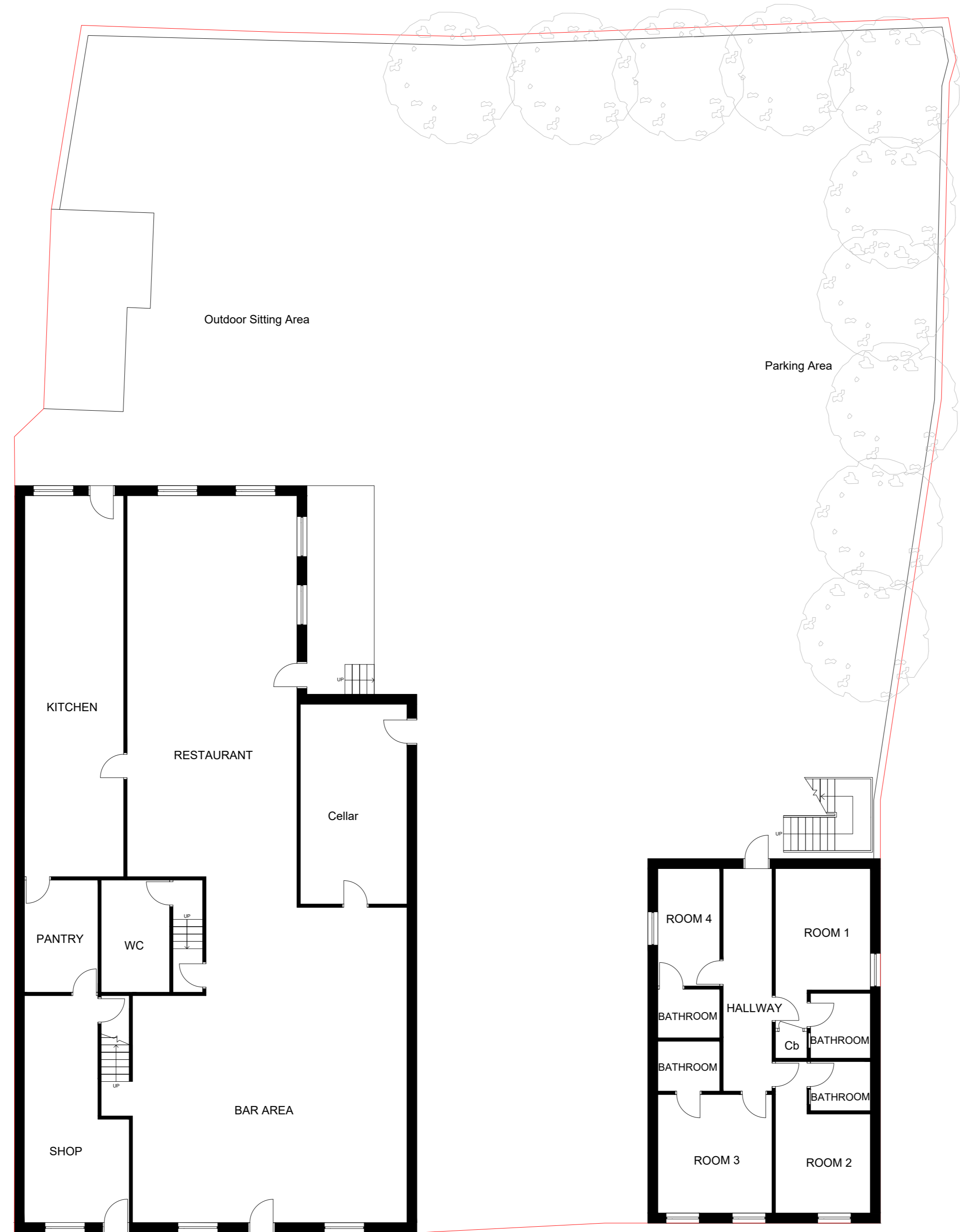
Existing Ground Floor Plan