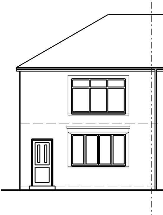
existing front elevation (1:100)