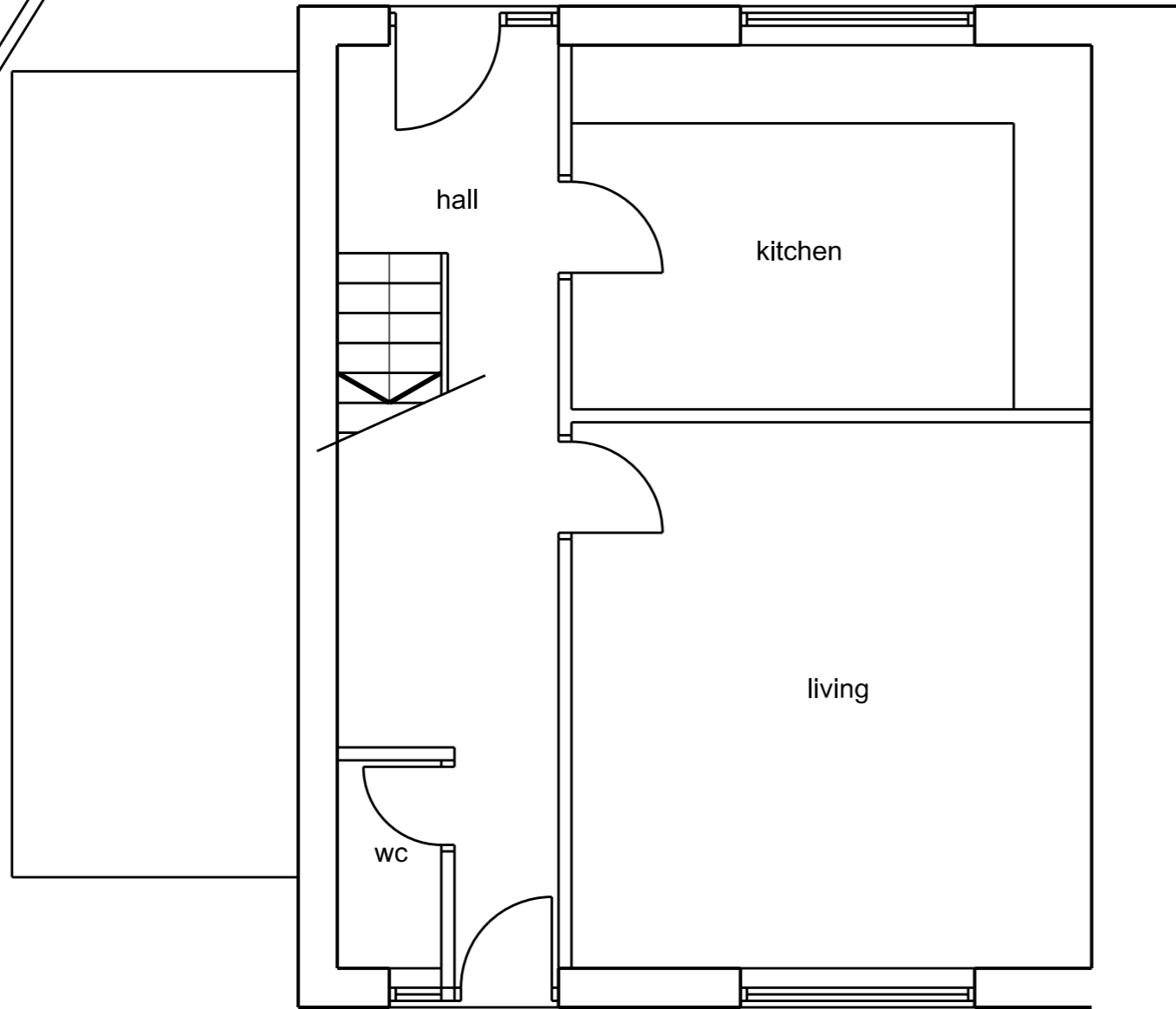
existing ground floor