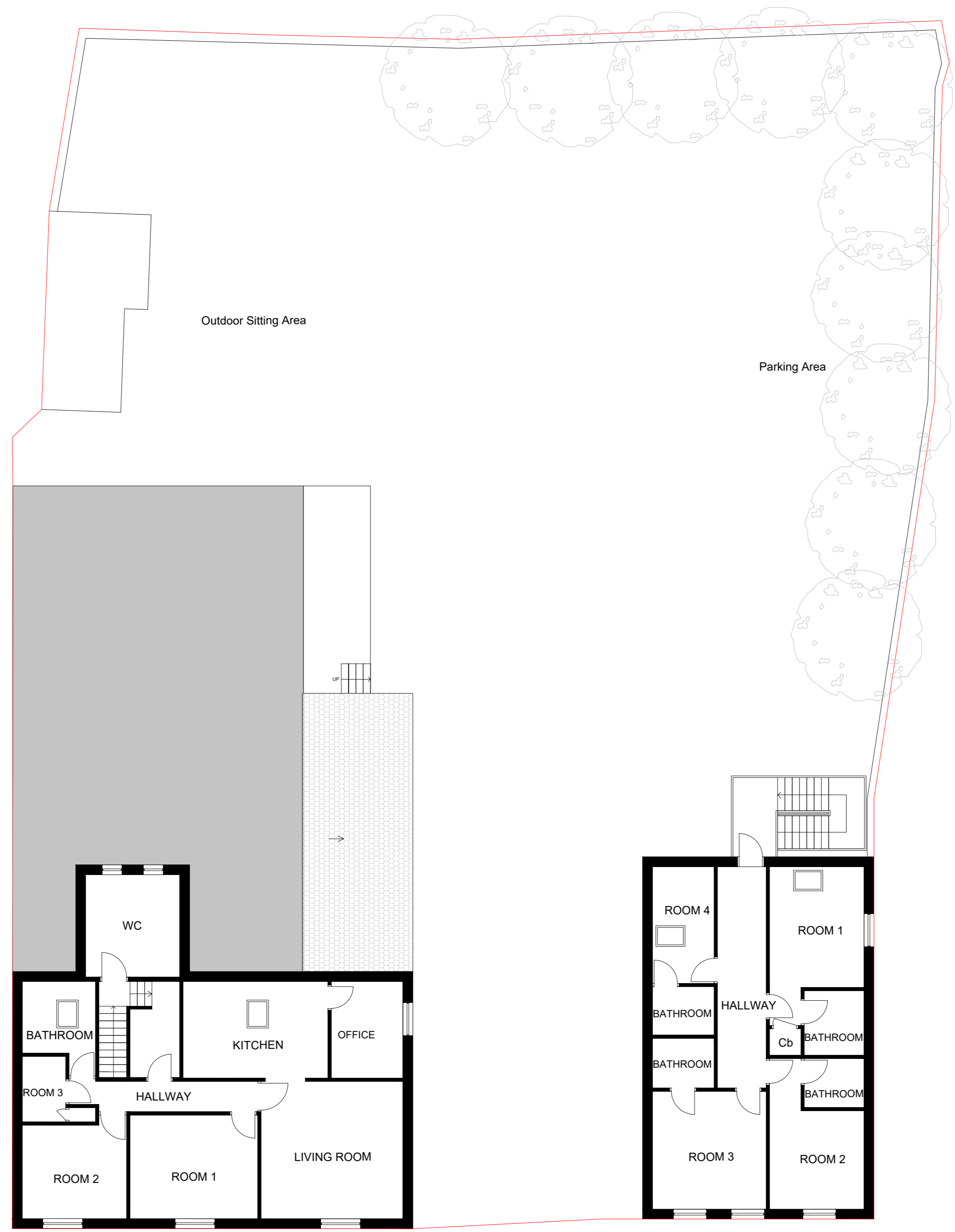
Existing First Floor Plan