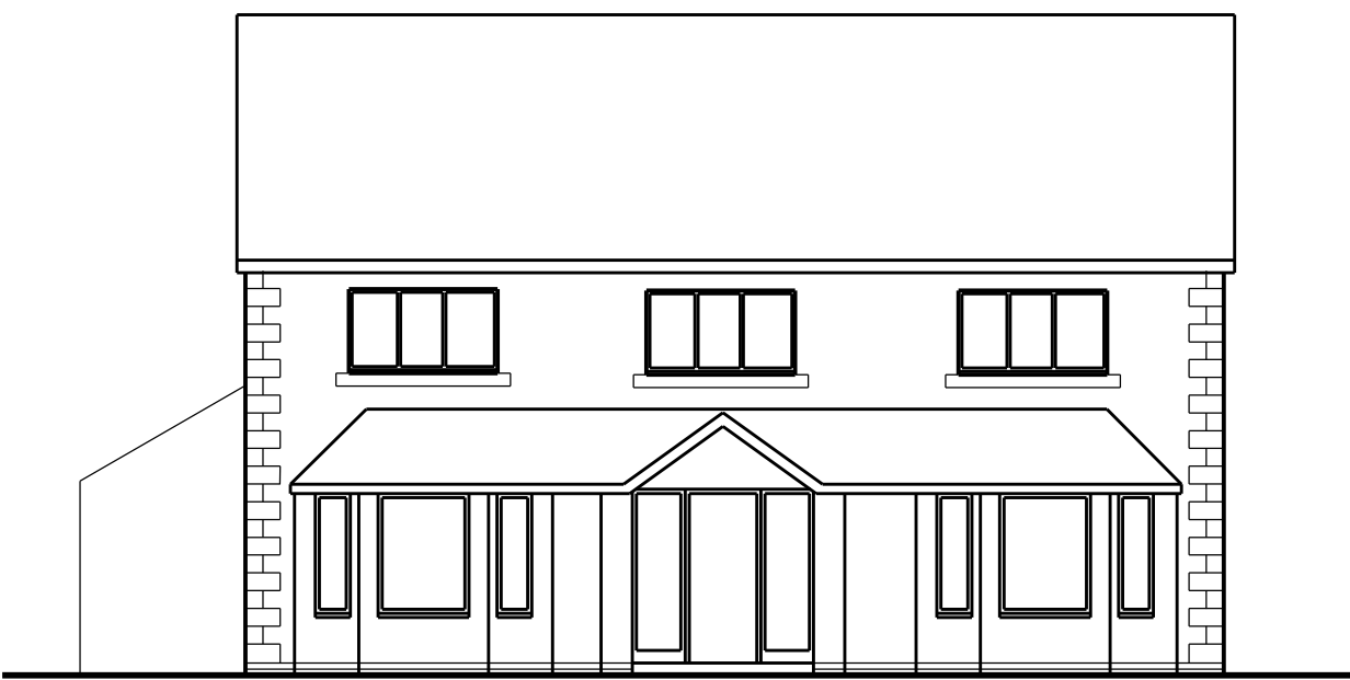
existing front elevation