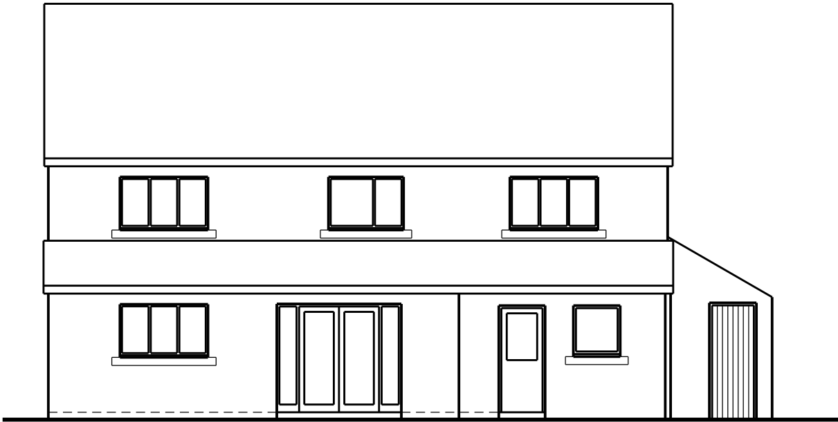
existing rear elevation