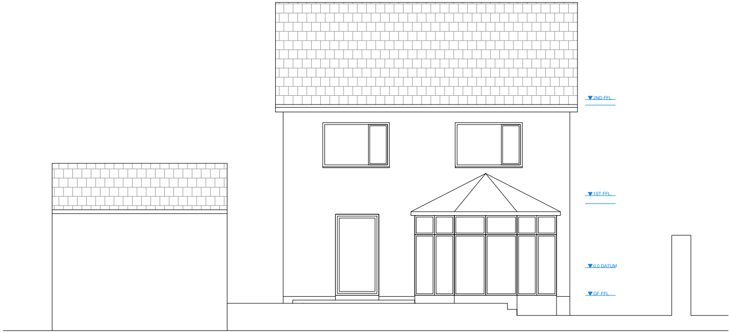
Existing North Facing Elevation 1:100 @ A3