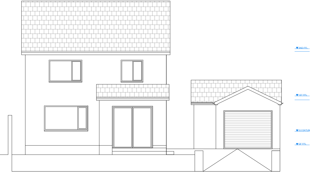
Existing South Facing Elevation 1:100 @ A3

NOTES: All dimensions and levels are subject to a thorough and accurate on site check by the contractor prior to the commencement of any works. All sizes of structural components are to be verified by a structural engineer.