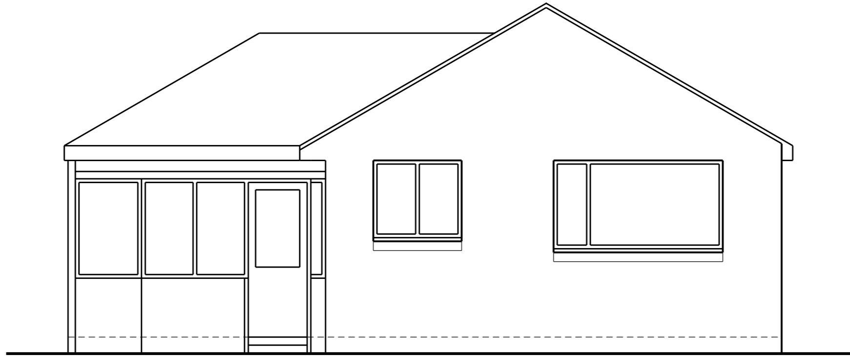
existing east elevation