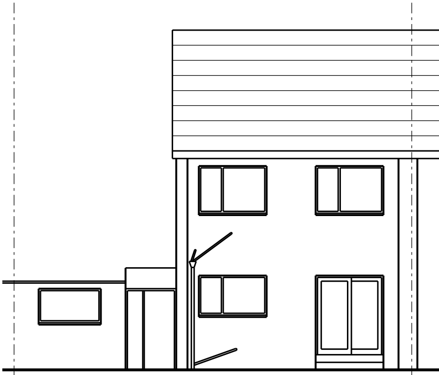
existing rear elevation