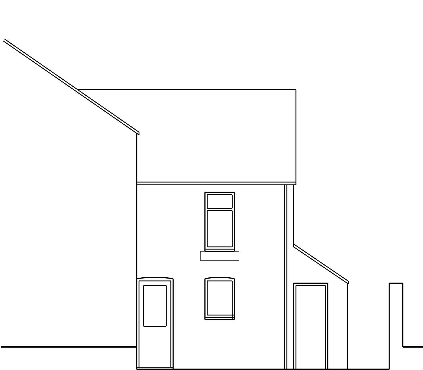
existing side elevation