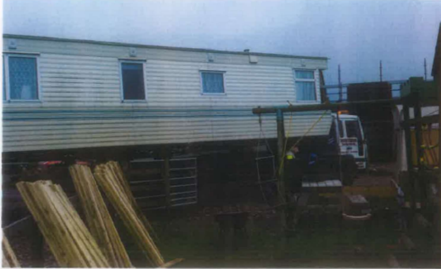
28/04/2014 - Picture from 1st floor of barn looking down into the garden. The static, site caravan, garden fence and children's football nets are in the photo.