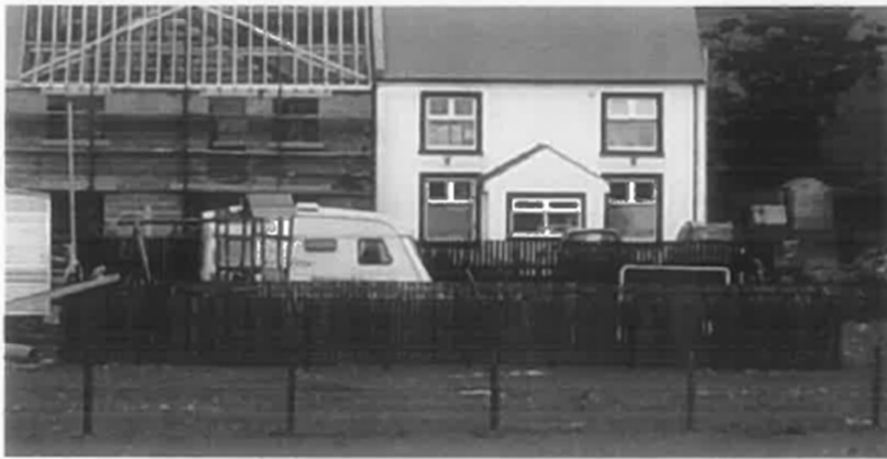
Image dated 20 th March 2014 clearly showing the garden area fenced off with the children's goal posts and climbing frame in situ and the touring caravan.