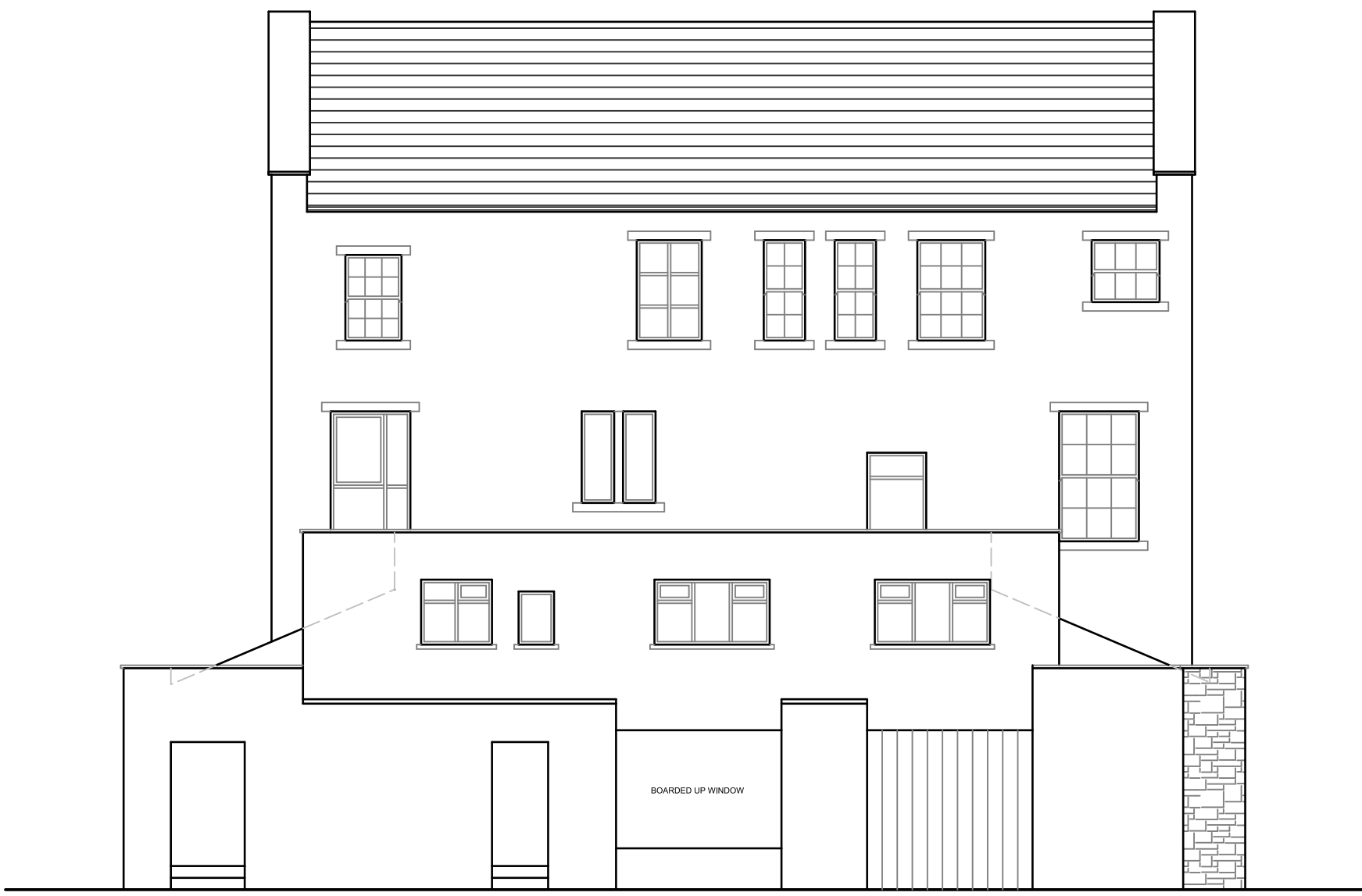
NE ELEVATION FROM SCHOOLHOUSE LANE