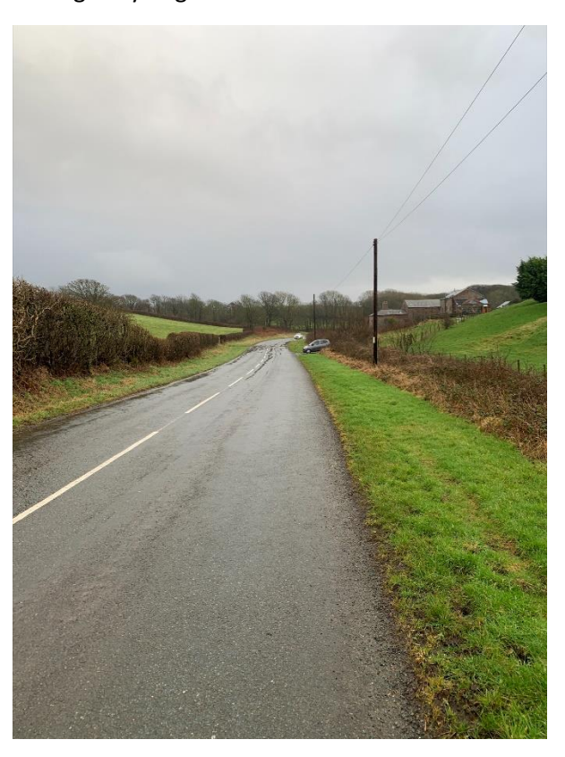
Image 3 – view of car from point of 70m to left of access from nearside of road.