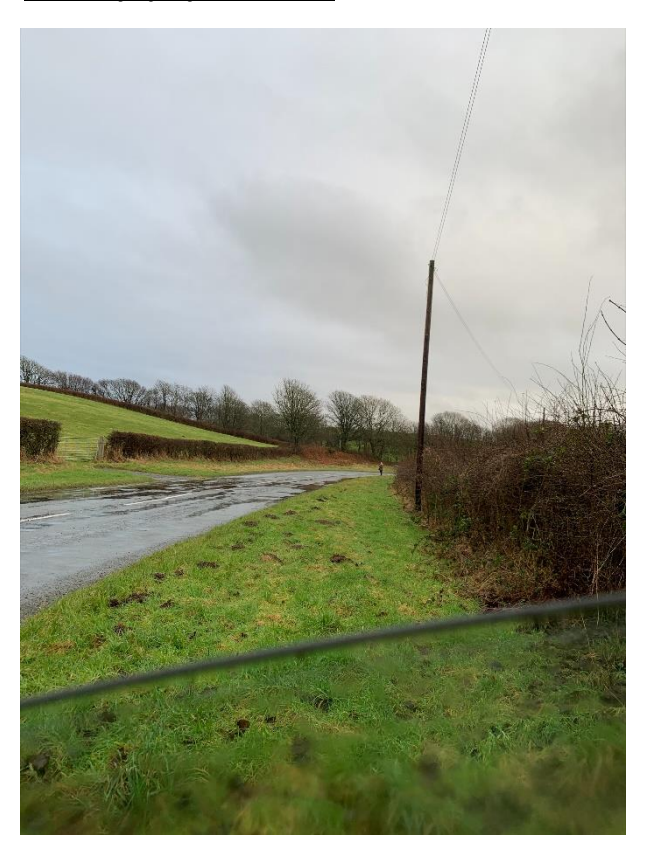
Image 1 – view to right from 2.4m back, person at preferred 71m distance along carriageway edge