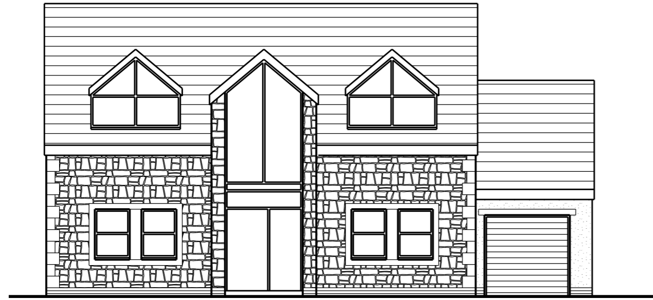
elevation A (east)