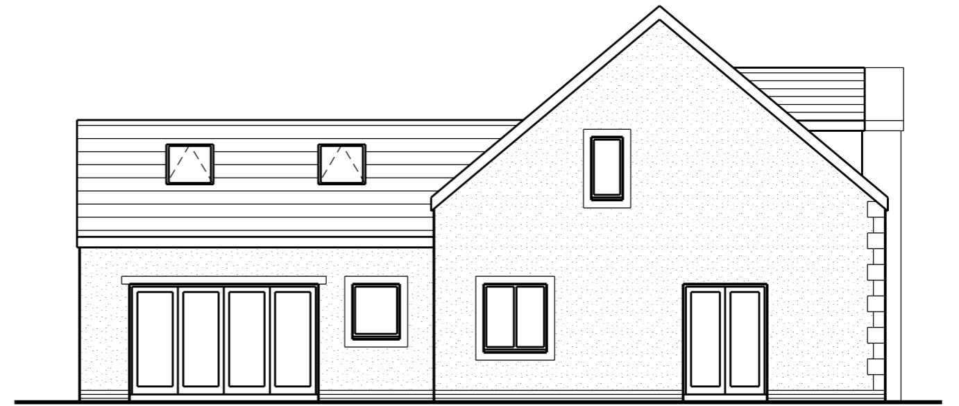
elevation B (south)