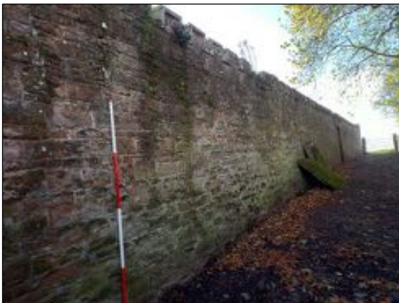
Plate 96: View looking west showing the north boundary wall of the walled garden with the gate at the end providing access to a field