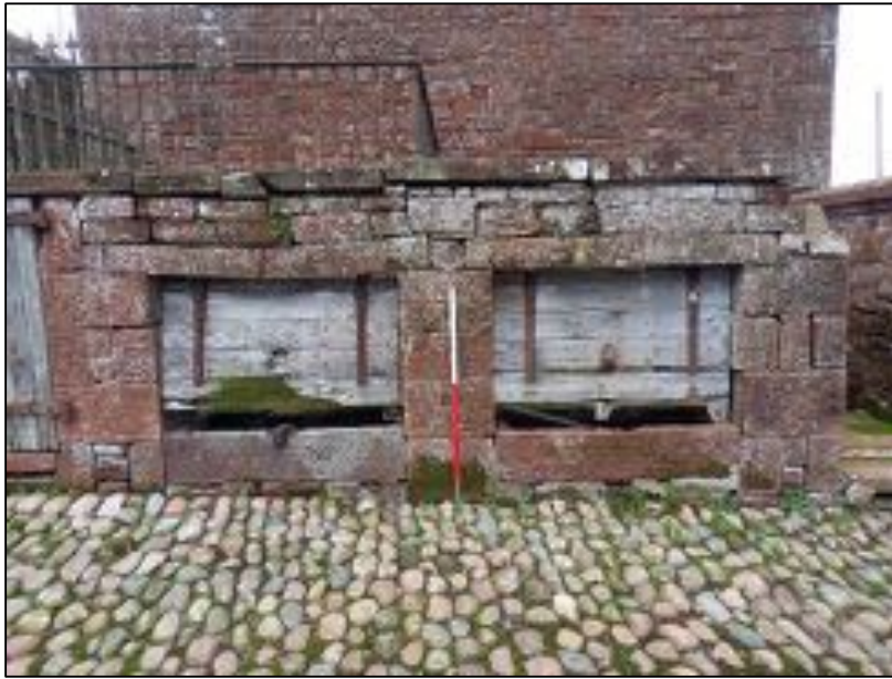
Plate 101: Detail of feeding hatches, south elevation of Hennery-Piggery (Scale = 1m)