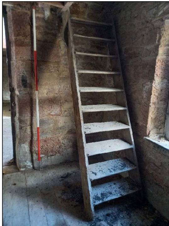
Plate 59: Detail of wooden ladder, Room F in northern projection (Scale = 2m)