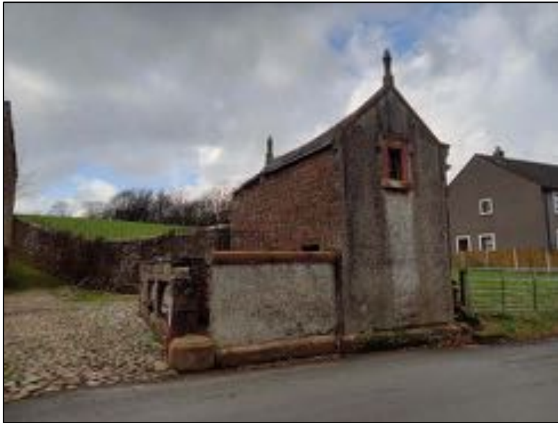
Plate 99: East elevation of the Hennerly-Piggery facing onto Morass Road