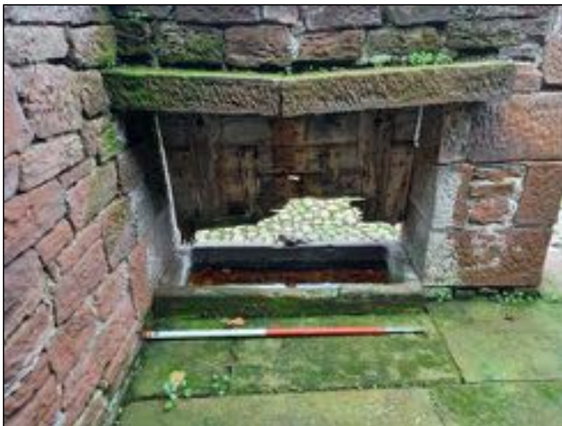
Plate 102: Internal view of one of the feeding troughs, Hennery-Piggery (Scale = 1m)