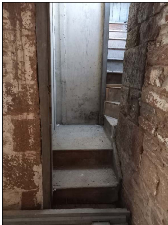
Plate 64: Upper floor of southern projection showings wooden stairs to the pigeon loft