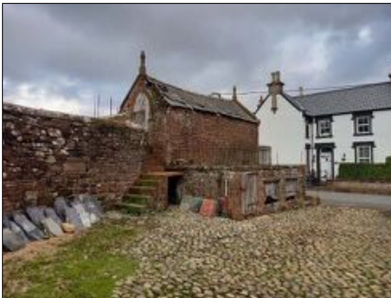
Plate 98: View looking north-east showing the Hennerly-Piggery, with Morass Road behind