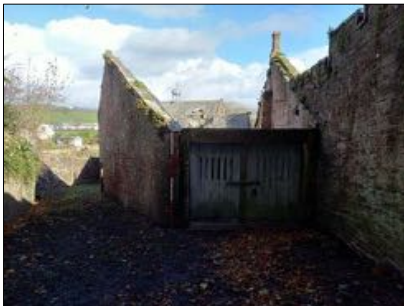
Plate 94: View looking east showing the west end of the ancillary buildings