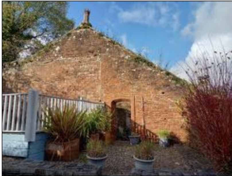
Plate 93: South elevation of part of the ancillary buildings showing the scarring of a former glass house