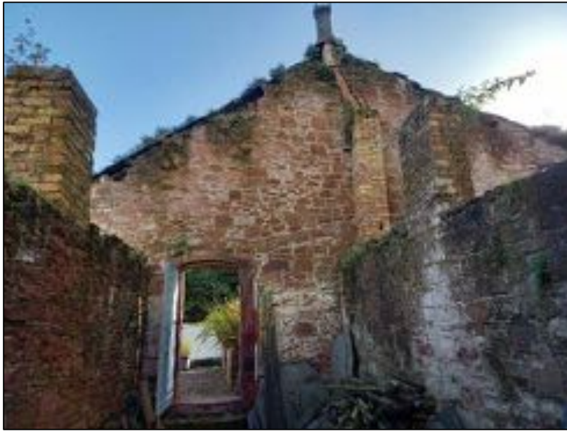
Plate 91: View looking south towards the garden through one of the rooms in the ancillary buildings