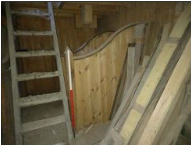
Plate 76: Possible reset stable dividers, possibly utilised as storage bays, first floor of barn (Scale = 1m)