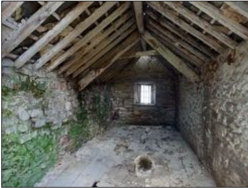
Plate 107: View looking east showing the first floor of the Hennerly-Piggery