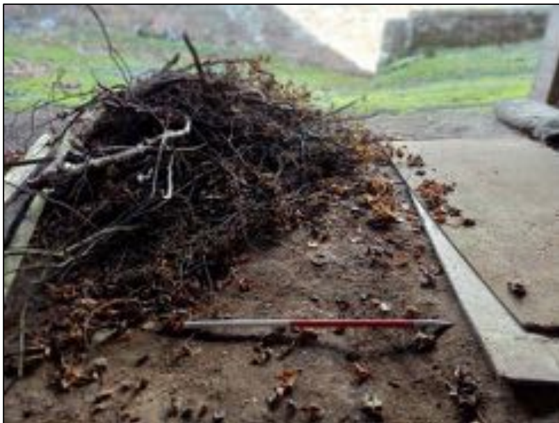
Plate 82: View looking north showing remains of metalwork in the floor of the ancillary building (Scale = 1m)