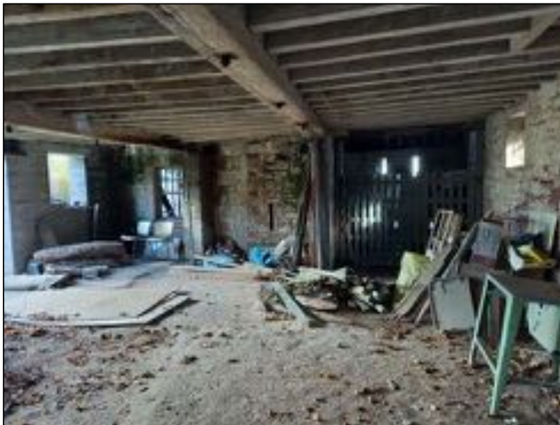
Plate 80: View looking east showing the ancillary building closest to the barn, showing the long beams