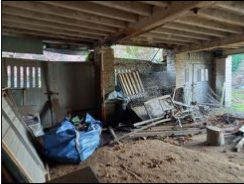
Plate 83: West wall of the ancillary building showing the three double doorways (Scale = 2m)