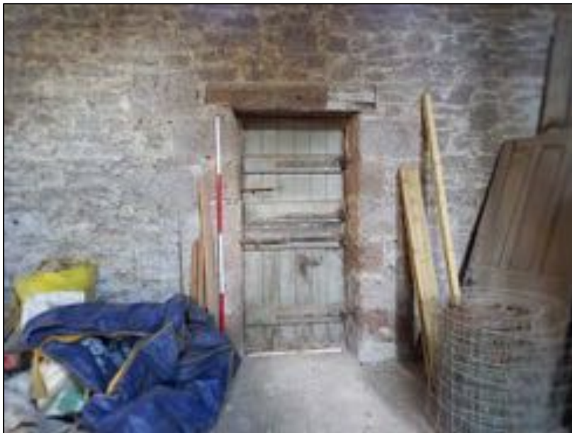
Plate 74: Detail of door in east elevation, first floor of barn (Scale = 2m)