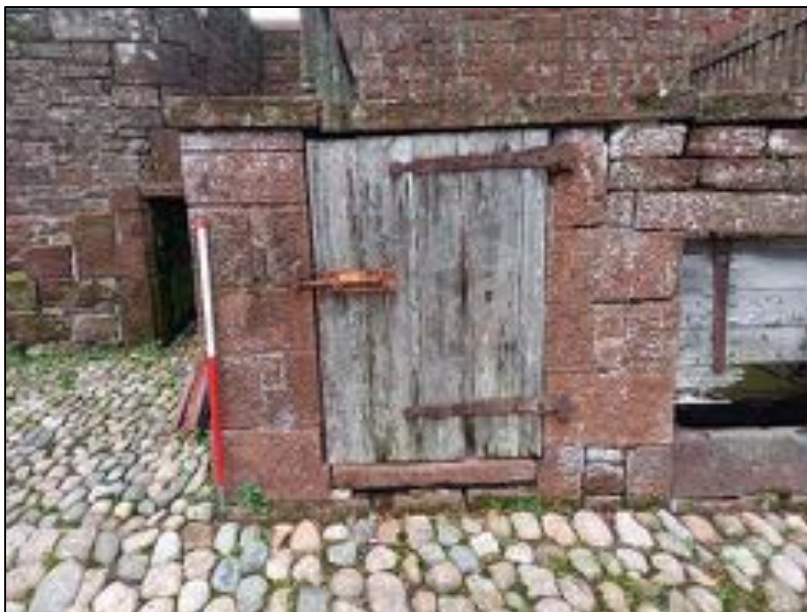
Plate 100: Detail of access door, south elevation of Hennerly-Piggery (Scale = 1m)