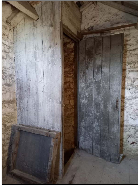
Plate 63: Upper floor of the southern projection showing the doorway set in a boarded partition