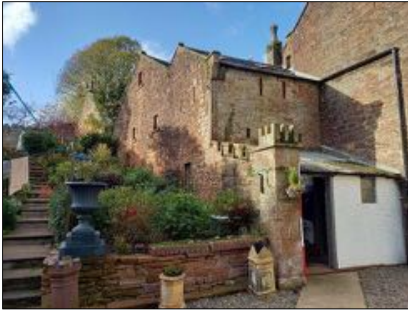
Plate 77: View looking west showing the ancillary buildings constructed to the west of the earlier barn