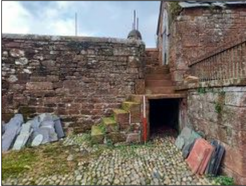
Plate 105: Stone staircase at the west side of the Hennery-Piggery (Scale = 1m)