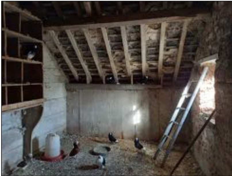
Plate 67: Detail of pigeon loft located at the southern end of the barn