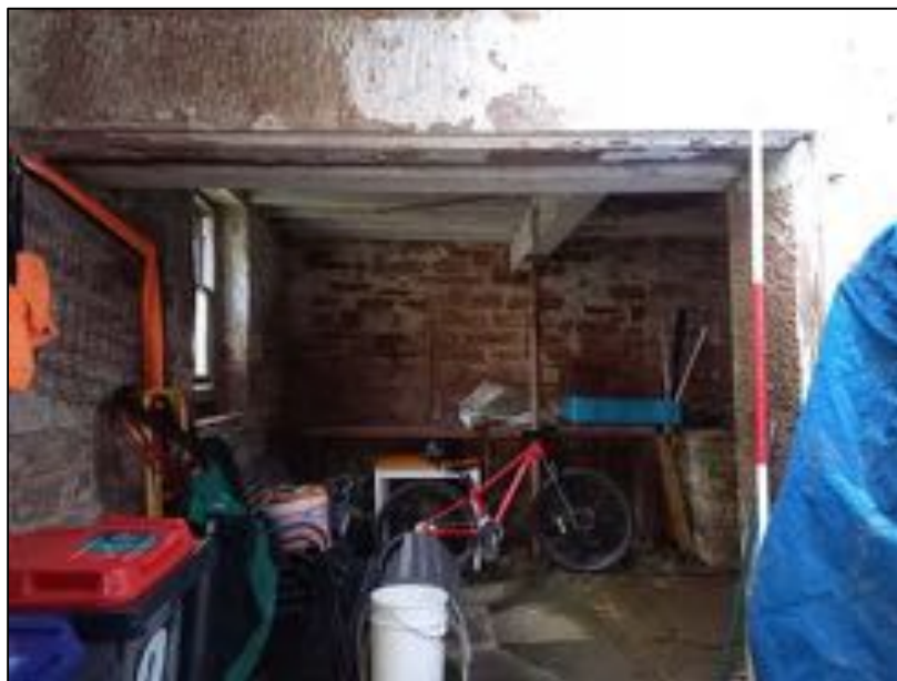
Plate 86: Large doorway in the east wall of the Wash House