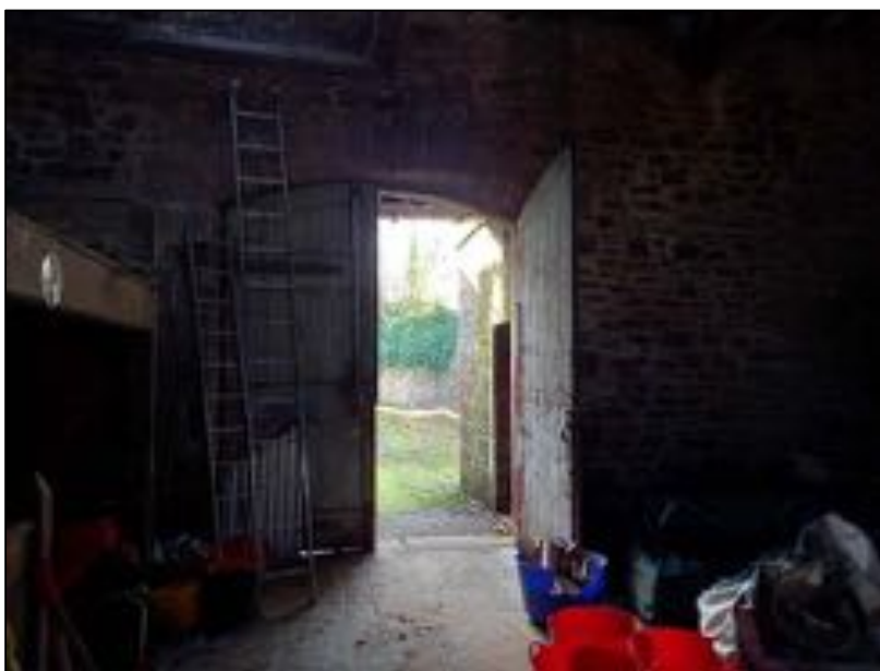
Plate 69: Detail of large doorway into the first floor of the barn, west elevation