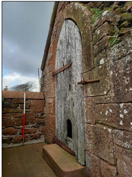
Plate 106: Detail of first floor doorway, west gable of the Hennery-Piggery (Scale = 1m)