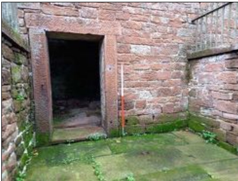
Plate 104: Detail of low doorway into one of the sties, Hennery-Piggery (Scale = 1m)