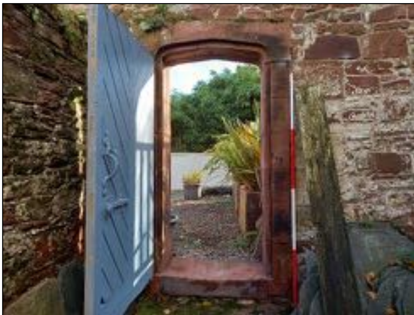
Plate 92: Detail of doorway to garden from the ancillary buildings (Scale = 2m)