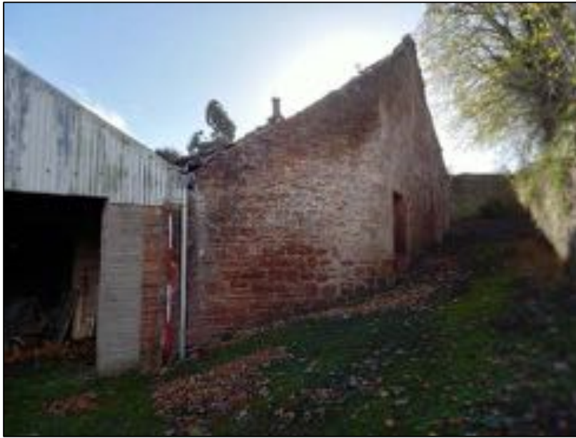
Plate 89: View looking west showing the roofless ancillary building, with evidence for three phases of construction visible in the stonework