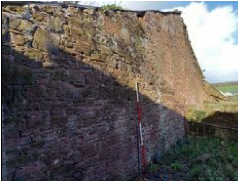
Plate 95: North wall of ancillary buildings, west end, showing evidence for former boundary wall prior to being increased and gabled