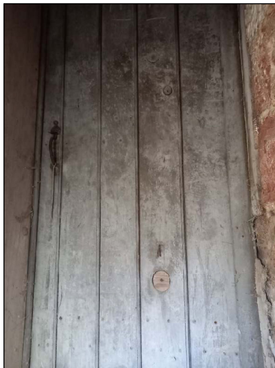
Plate 66: Detail of door to pigeon loft, as seen from the wooden stairs from the southern projection