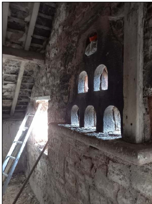
Plate 68: Detail of pigeon holes, southern gable of the barn