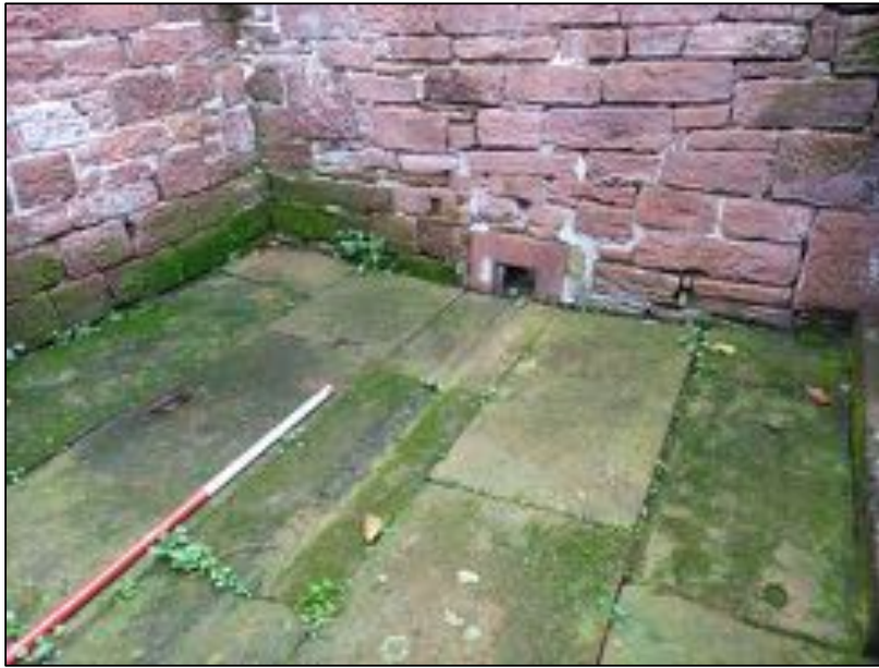
Plate 103: Detail of flagged floor of one of the pig sties in the Hennery-Piggery