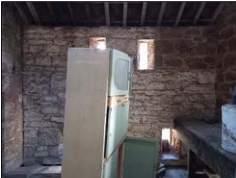
Plate 88: East wall of the addition (south side of Room G) showing ventilation slits