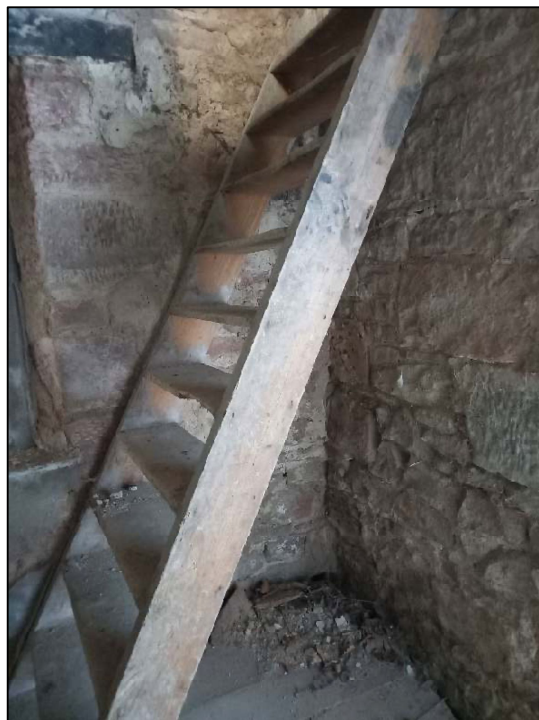
Plate 62: Detail of wooden ladder, Room G in southern projection