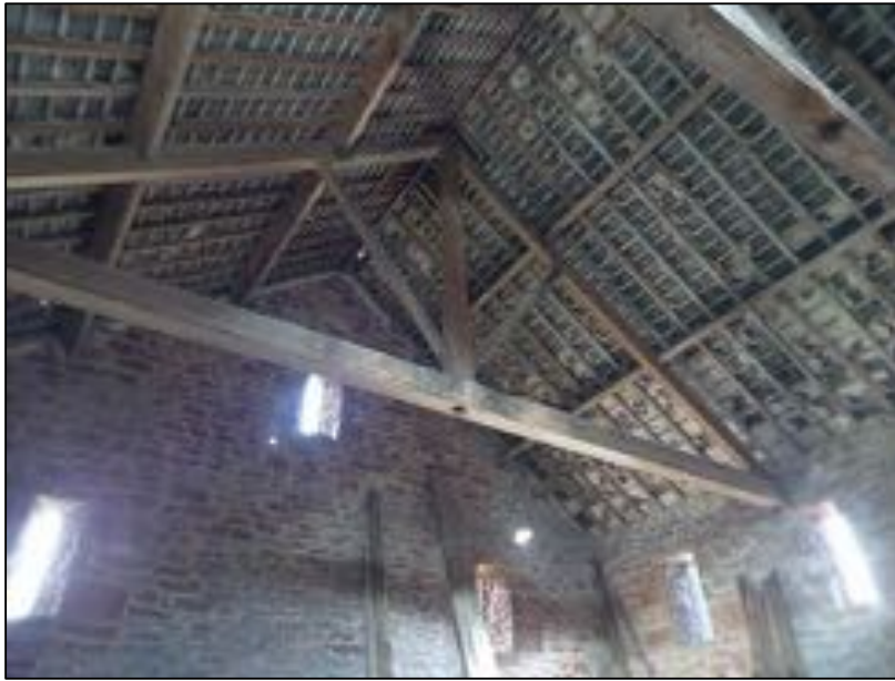
Plate 71: Detail of roof structure, first floor of barn