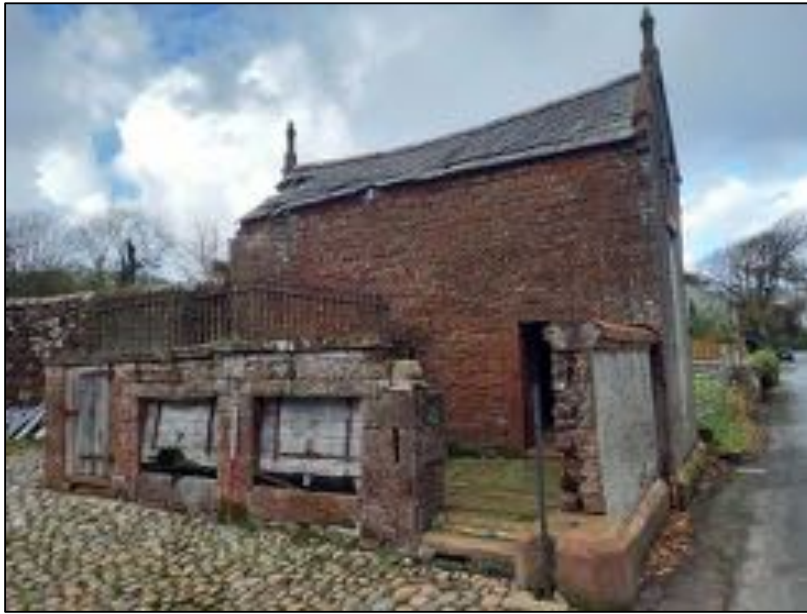
Plate 97: South elevation of the Hennerly-Piggery