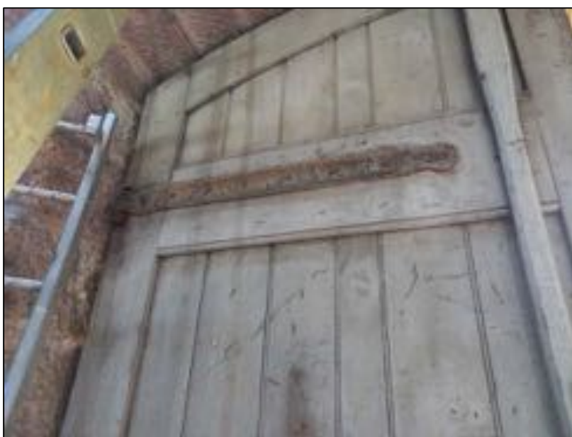
Plate 70: Detail of strap hinge, door to first floor of barn, west elevation