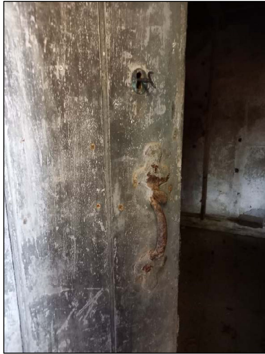
Plate 61: Detail of handle and lock, with remains of key, door into Room G, southern projection