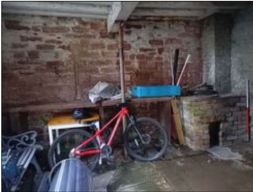
Plate 87: West wall of Wash House showing sandstone shelving and brick wash copper (Scale = 1m)