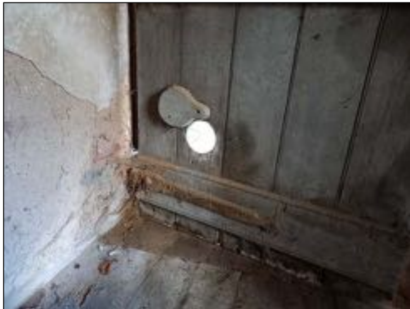
Plate 58: Internal side of door, Room F, northern projection, showing strap hinge and round opening