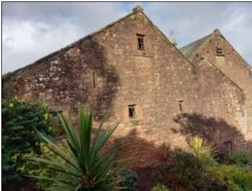
Plate 78: South elevations of the ancillary buildings