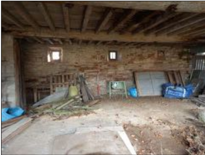
Plate 81: View looking south showing the interior of the ancillary building, possible horse engine house