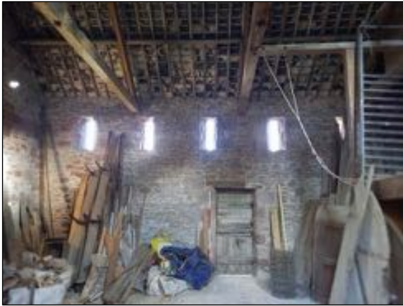
Plate 73: View looking east showing the doorway and ventilation slits in the east elevation, first floor of barn