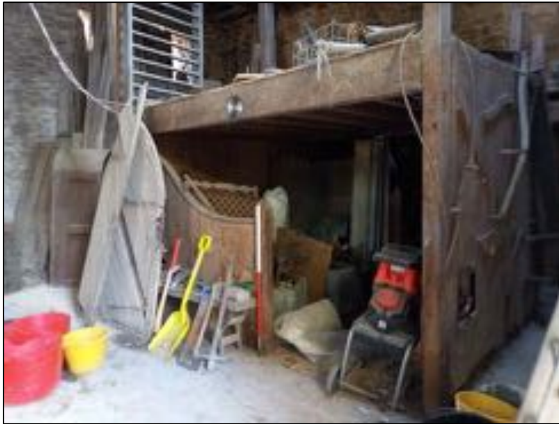
Plate 75: Possible reset stable dividers located on the first floor of the barn (Scale = 1m)