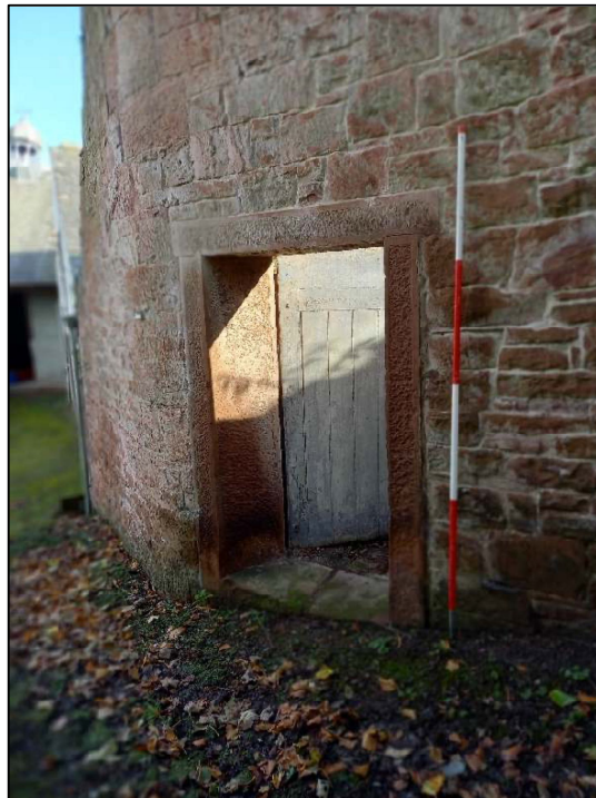
Plate 90: Detail of doorway in the north wall of the ancillary buildings (Scale = 2m)