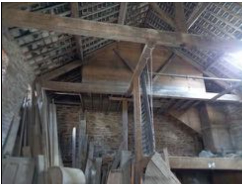
Plate 72: View looking south showing the first floor of the barn. The pigeon loft is located between the furthest roof truss and the south gable wall