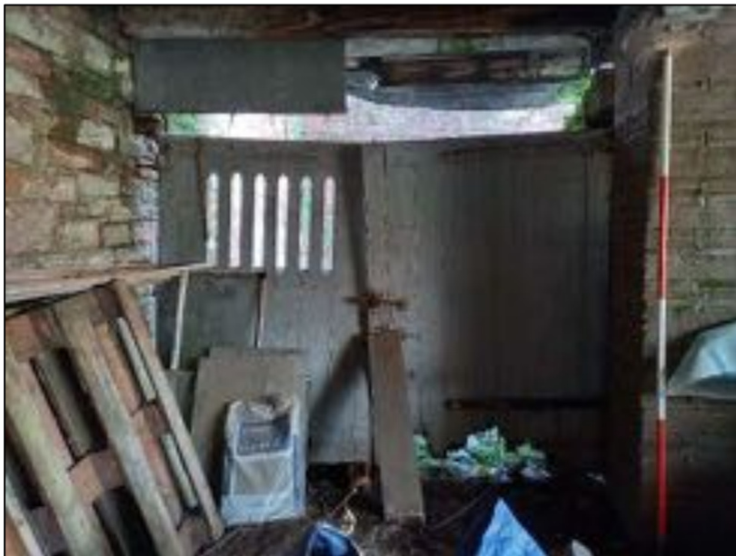
Plate 84: Detail of one of the large doorways in the west wall of the ancillary building