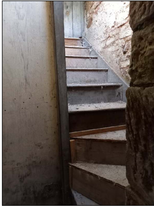
Plate 65: Wooden stairs to pigeon loft, accessed from the upper floor of the southern projection