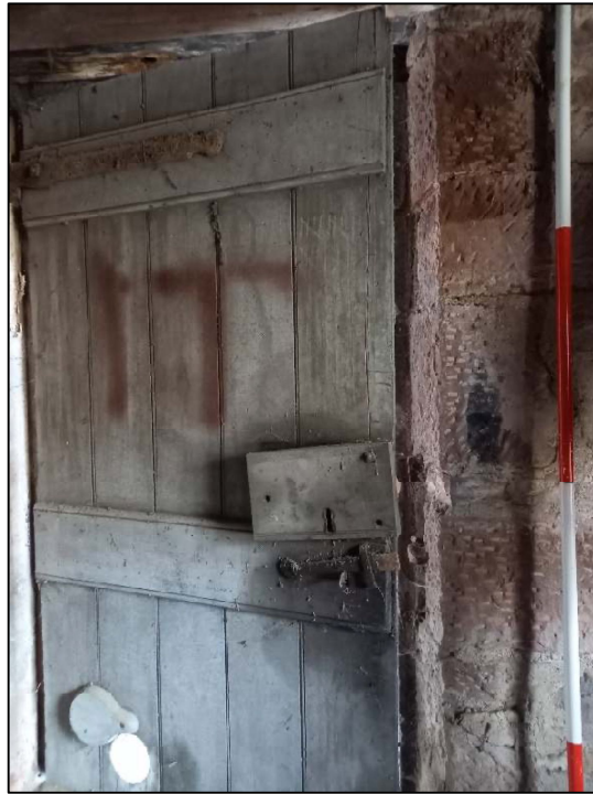
Plate 57: Internal side of door, Room F, northern projection