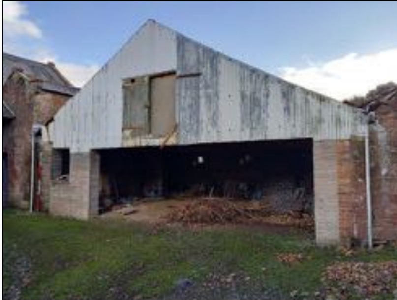
Plate 79: North elevation of one of the ancillary buildings (closest to the barn) (Scale = 2m)