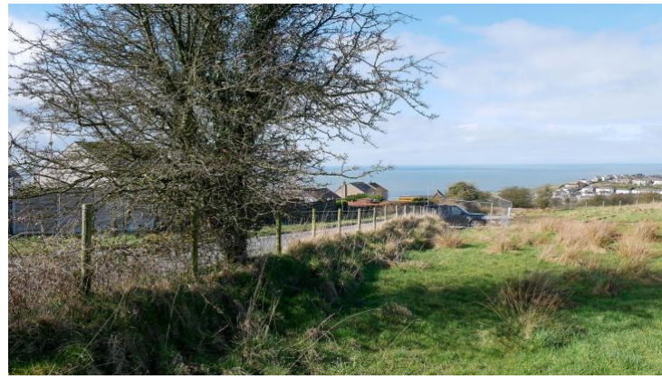
2. Remnant hedgerow bounding road