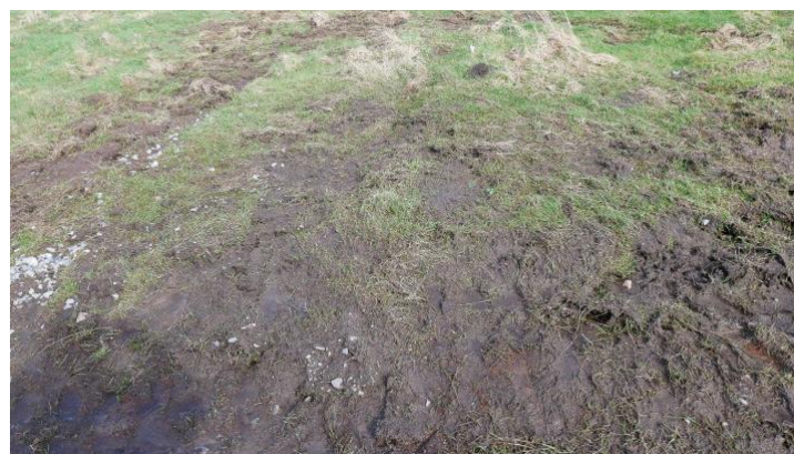
8. Typical ground conditions