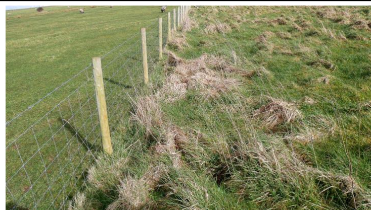
6. Rank Grassland area