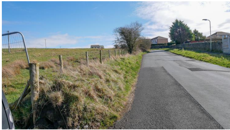
1. Land boundary with Harras Road