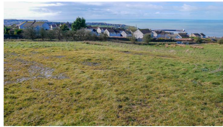
3. Poor quality semi-improved grassland