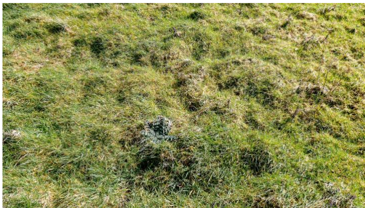
4. Poor quality semi-improved grassland