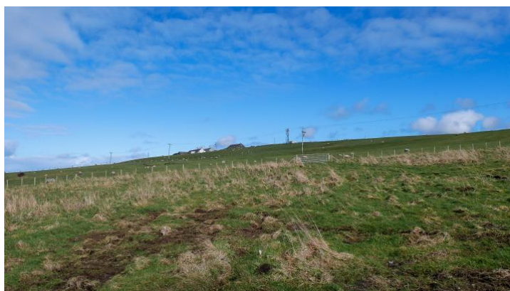
7. General view of land