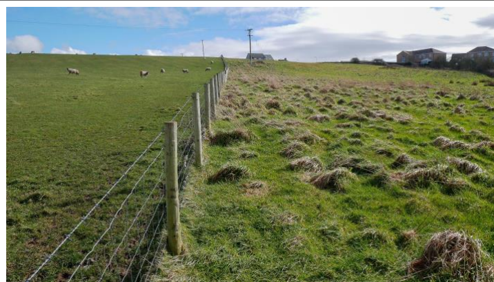
5. Sheep grazed field adjoining land