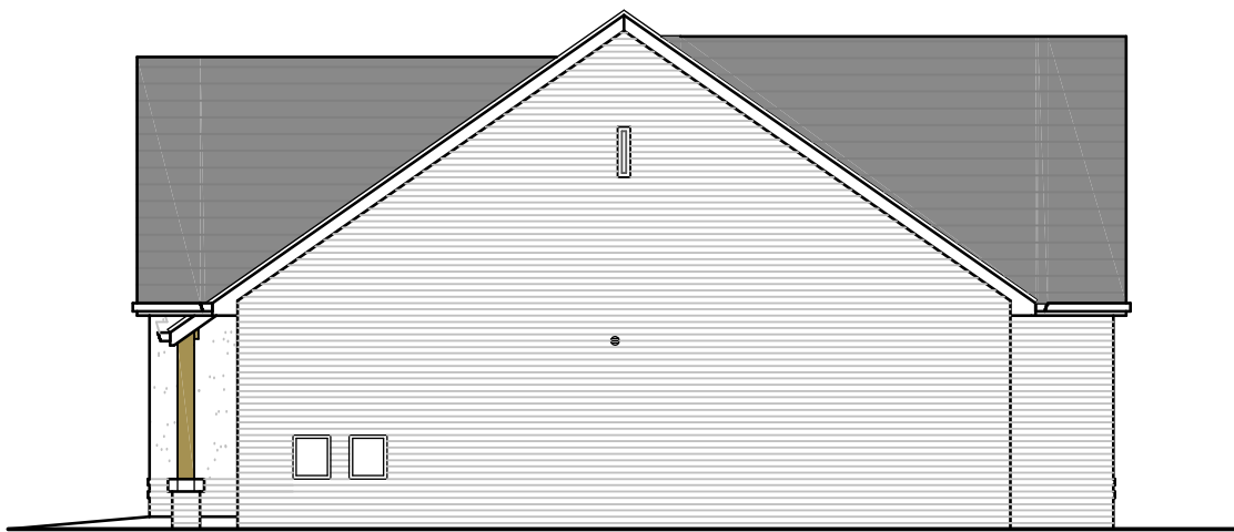
SIDE ELEVATION 2