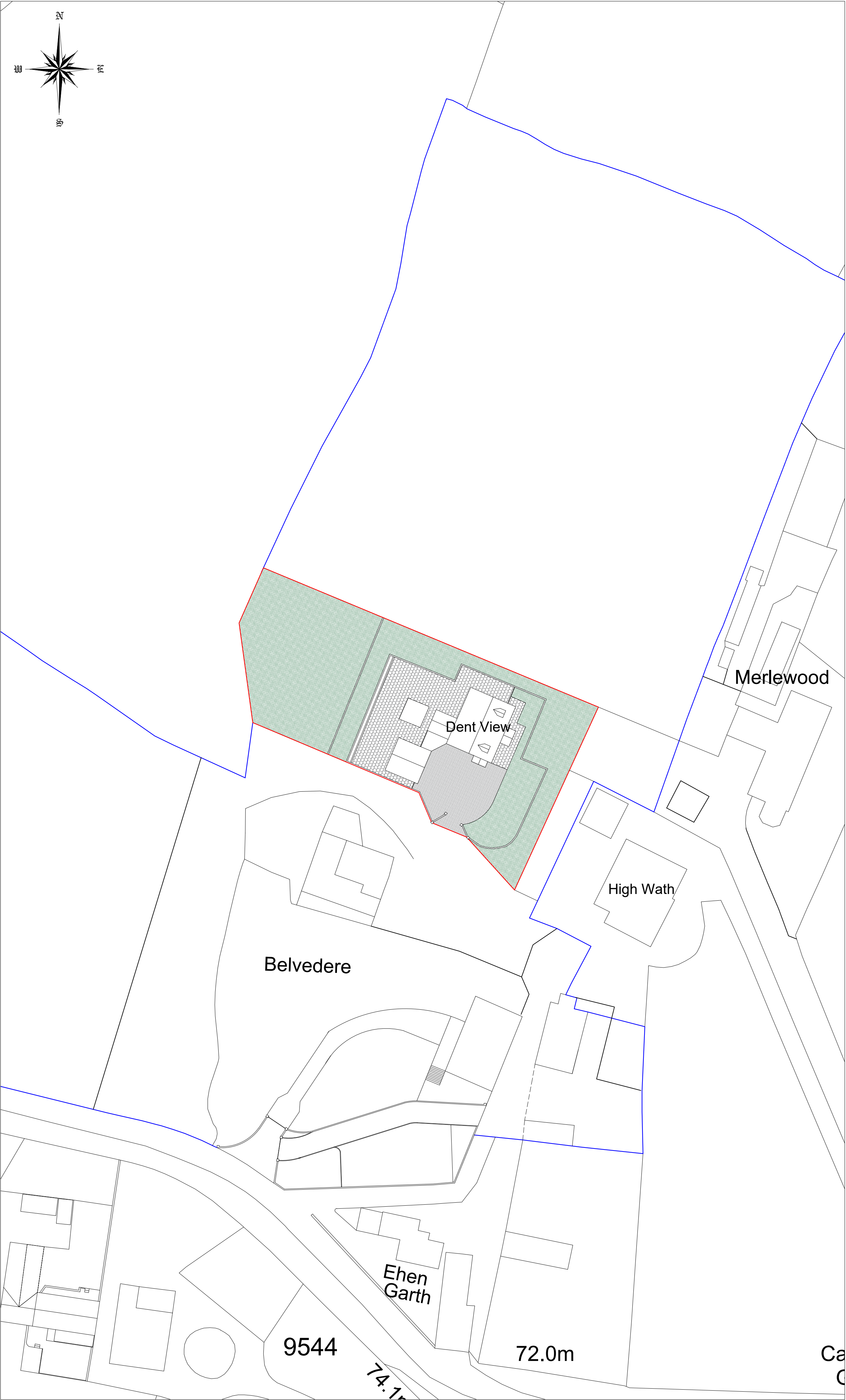
Existing Site Plan 1/500