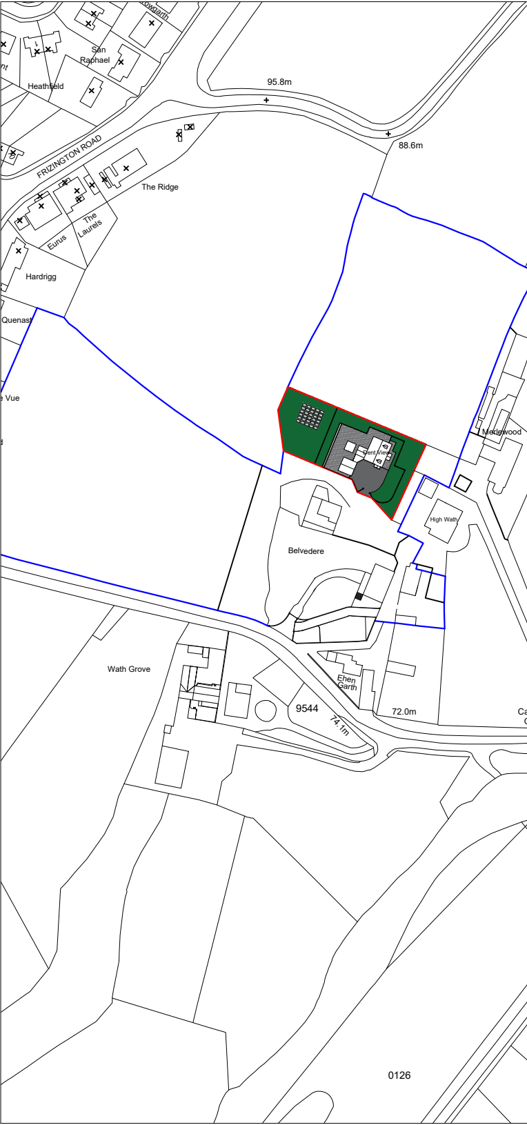
Site Plan 1/2500