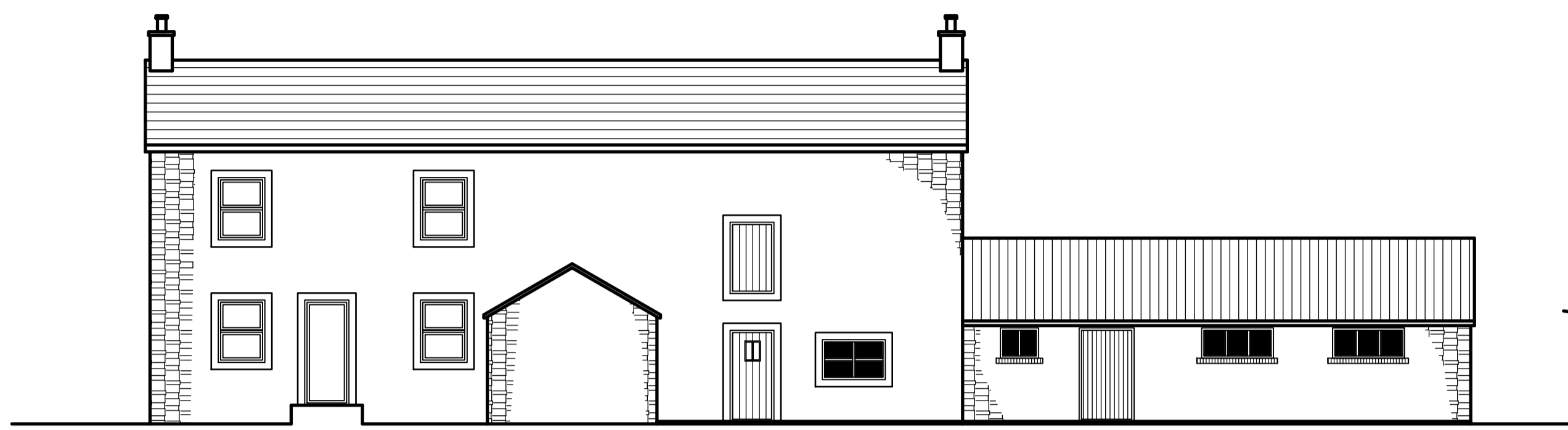
FRONT ELEVATION AS EXISTING Scale 1:100 @ A1 Scale 1:200 @ A3

This drawing is for the sole purpose of obtaining Local Authority Planning & Building Regulation approval only. The building contractor shall be responsible for the checking of all dimensions on site. The building contractor shall be responsible for the stability of the existing structures during the demolition & construction works. The building contractor shall be responsible for the correct setting out of all works on site.