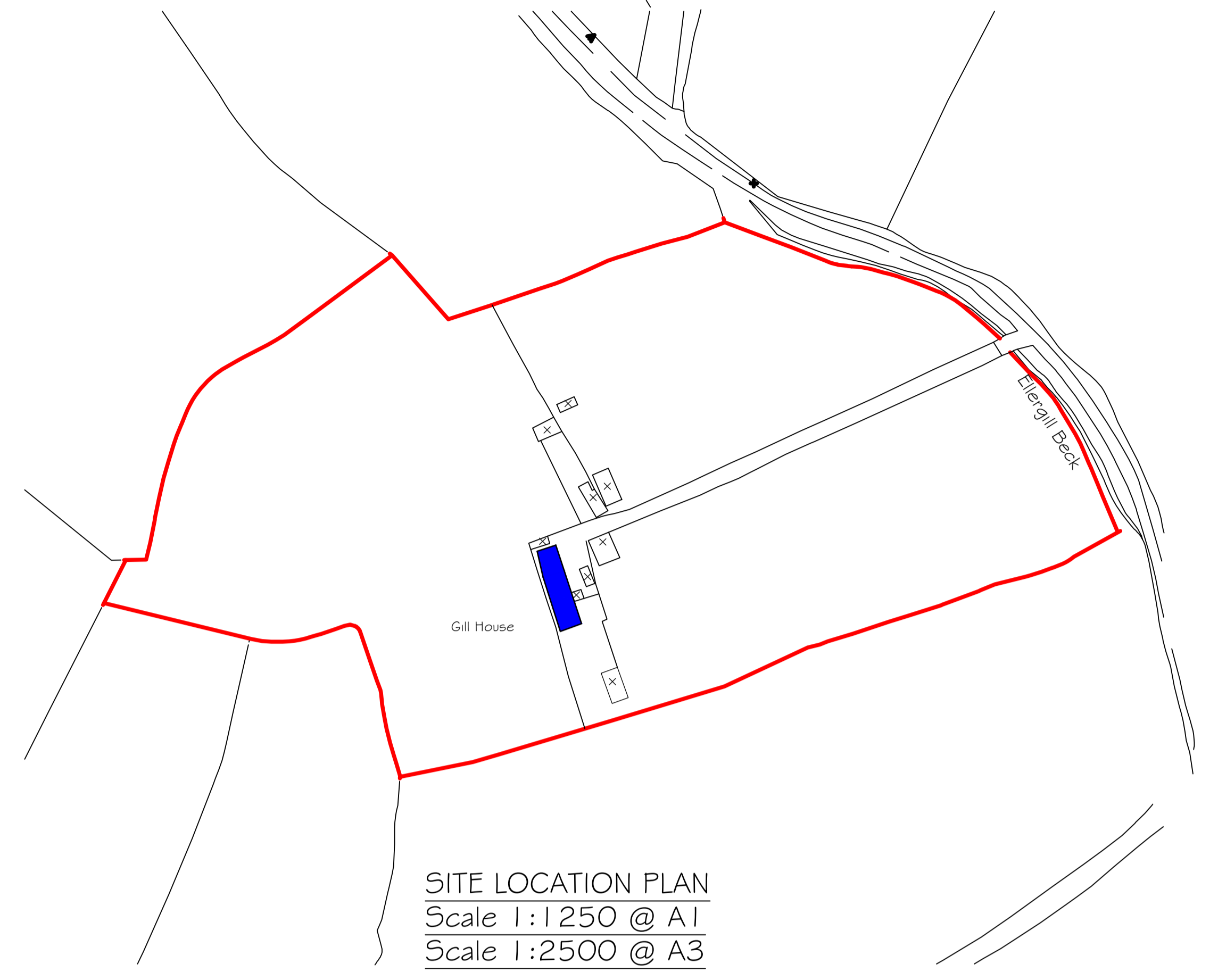
SITE LOCATION PLAN Scale 1:1250 @ A1 Scale 1:2500 @ A3