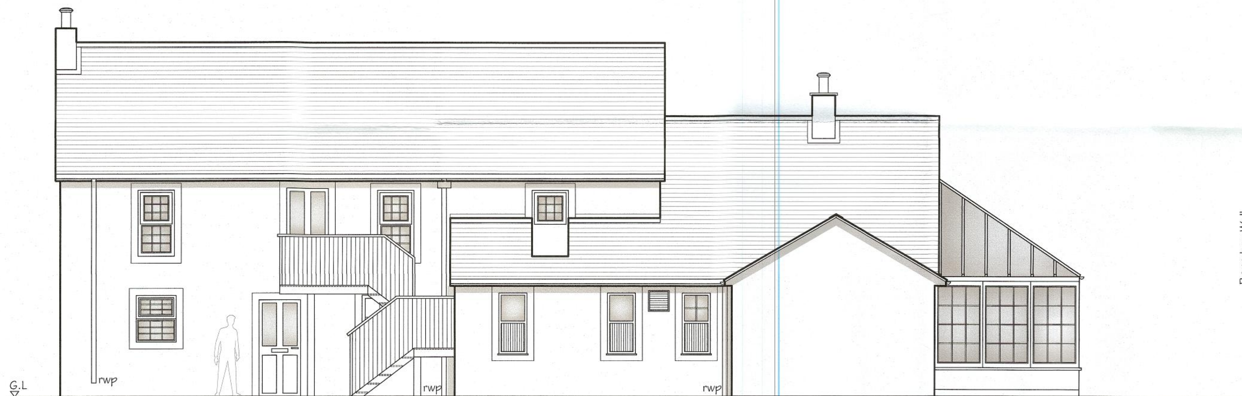
REAR ELEVATION AS EXISTING Scale 1:50